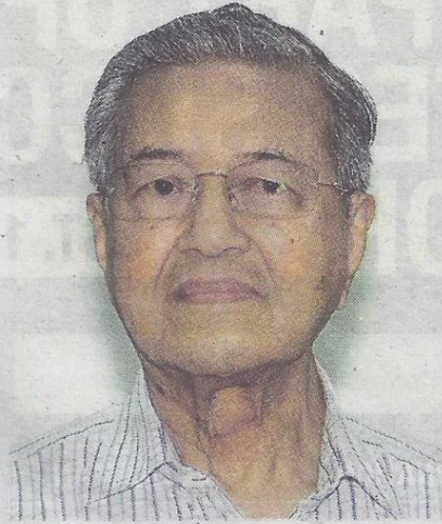
Tun Dr Mahathir Mohamad

"The way I see it, Hadi has more charisma than the late (Datuk) Fadzil Noor, (Datuk) Nik Abdul Aziz Nik Mat and (Tan Sri) Dr