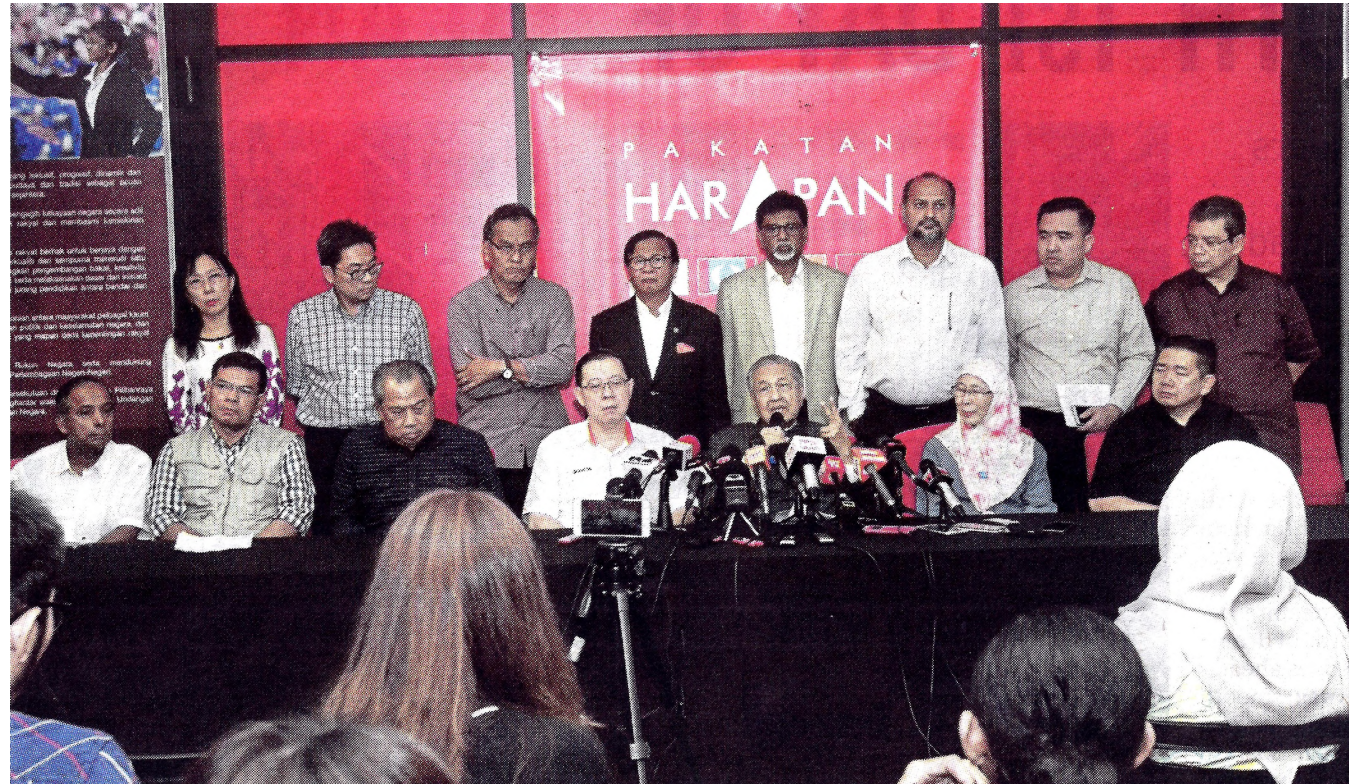
Prime Minister Tun Dr Mahathir Mohamad, flanked by Pakatan Harapan (PH) leaders, speaking at a press conference after chairing a PH meeting in Petaling Jaya, Dr Mahathir says a major accomplishment of the PH government is staying together after one year.