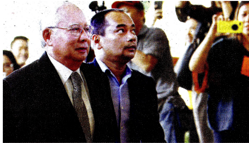
Najib arriving at the Kuala Lumpur High Court yesterday.