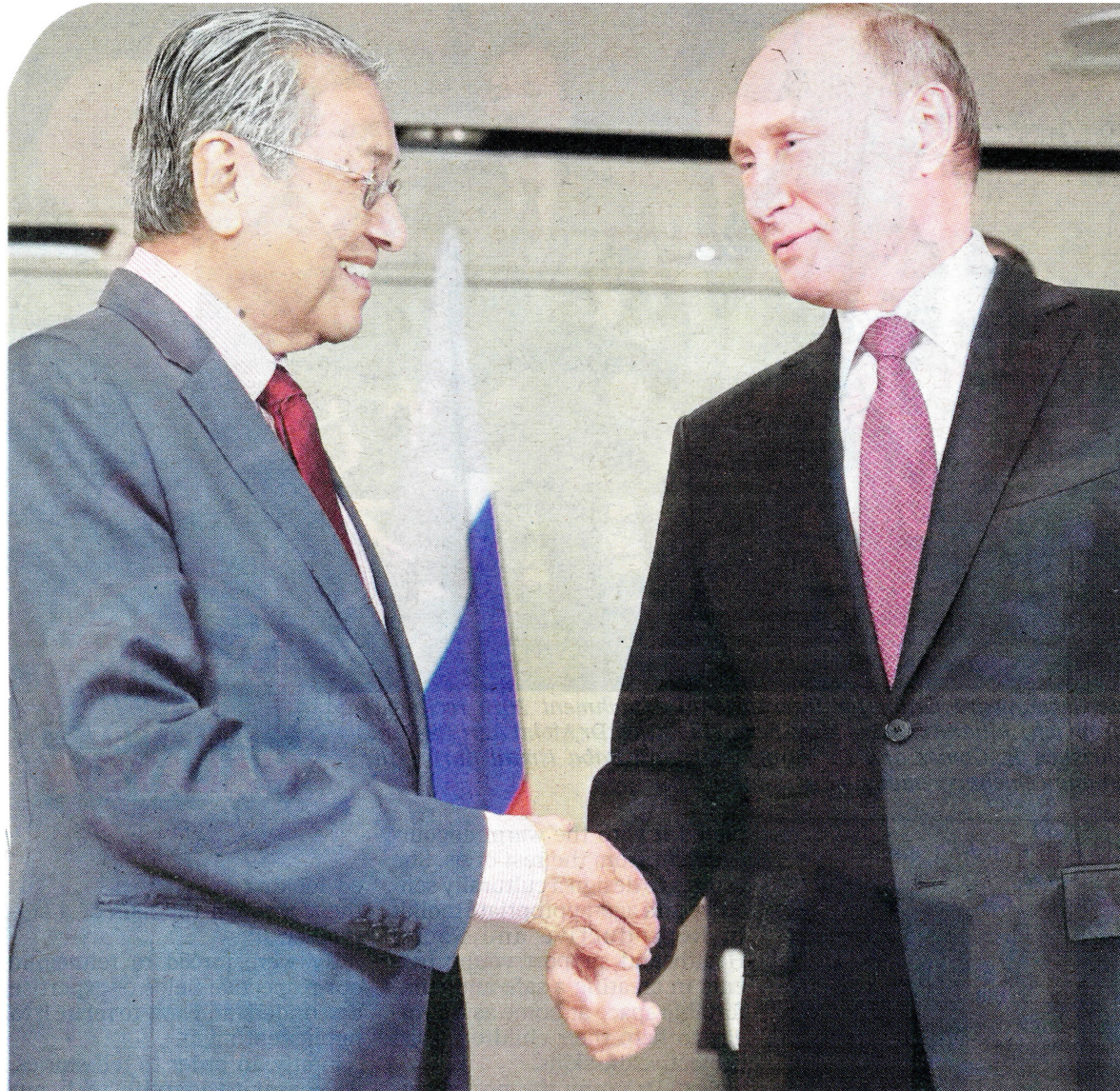
Russian President Vladimir Putin meeting with Prime Minister Tun Dr Mahathir Mohamad on the sidelines of the 33rd Asean Summit in Singapore last year