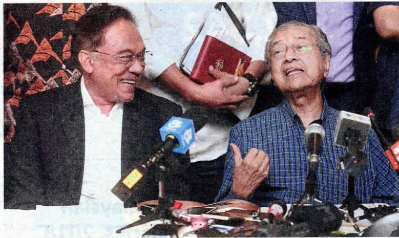
Time to deliver: The public is counting on and holding accountable all promises made by the Pakatan government.

Now, it's apparent Azmin isn't rooting for his party boss but Dr Mahathir instead, the leader of another party, Parti Pribumi Bersatu Malaysia, a component