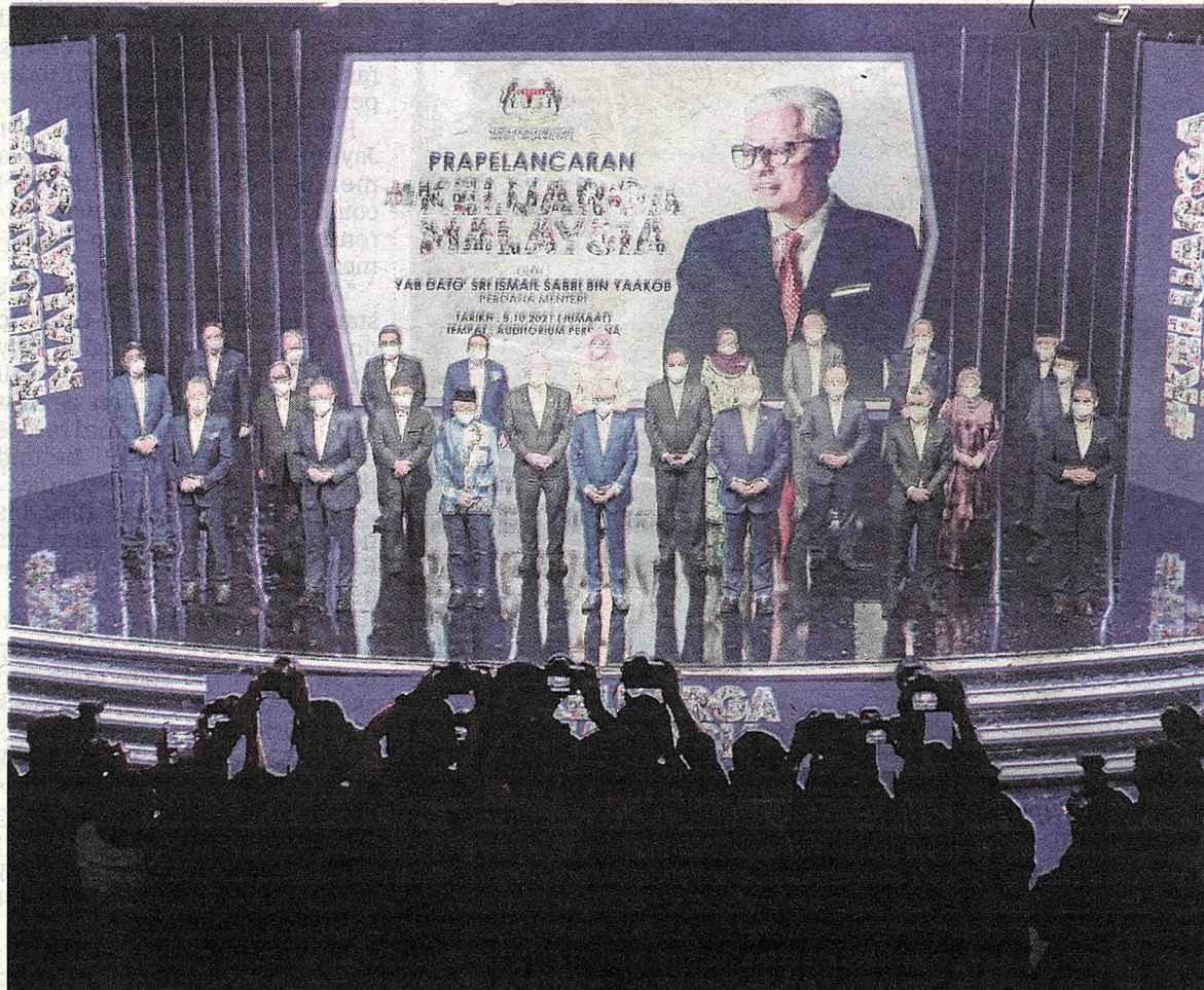
Prime Minister Datuk Seri Ismail Sabri Yaakob with senior government leaders at the pre-launch of the #Keluarga Malaysia concept in October.