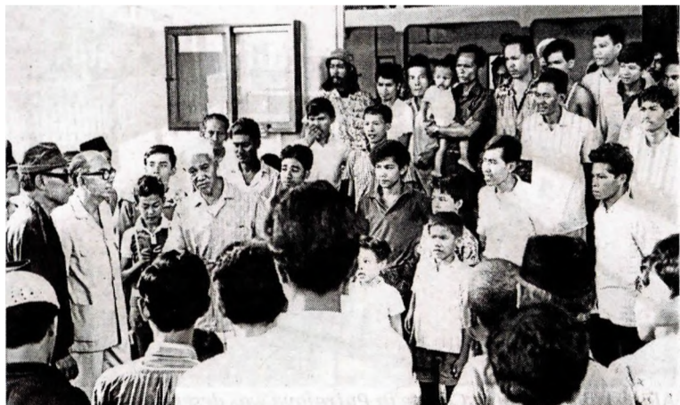
Tun Abdul Razak speaking to residents of Kampung Bahru during his tour of the worst affected areas during the 1969 riots.