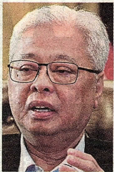
Datuk Seri Ismail Sabri Yaakob