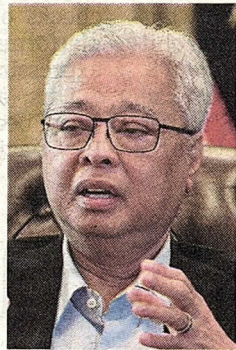
Datuk Seri Ismail Sabri Yaakob

“On this, we must work together to reform the organisation and we hope member states will demonstrate openness, flexibility, and political will in the interest of international peace, security, and prosperity.”