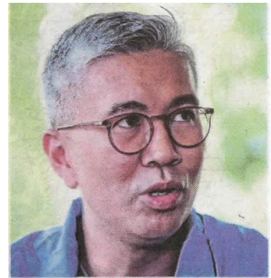
Tengku Datuk Seri Zafrul Tengku Abdul Aziz

Jana Wibawa programme was proposed by Tengku Zafrul.