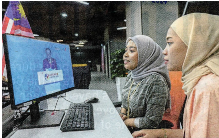
Civil servants in Kuala Lumpur listening to Prime Minister Datuk Seri Anwar Ibrahim speak at the closing ceremony of the 44th and 45th Asean Summit and Related Summits in Vientiane, Laos, yesterday.

Anwar officially received the chairmanship from Laos Prime Minister Sonexay Siphandone