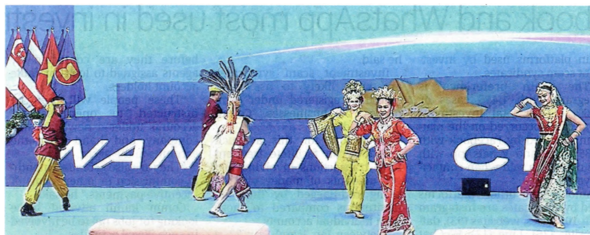
Rapt attention: Audience listening to Anwar's video address during the opening of the 21st China-Asean Expo and China-Asean Business and Investment Summit in Nanning. (Left) Performers dressed in traditional attires performing at the summit.