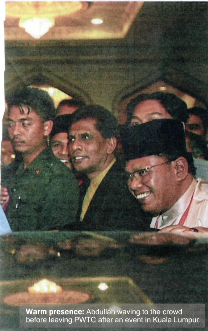
Warm presence: Abdullah waving to the crowd before leaving PWTC after an event in Kuala Lumpur.