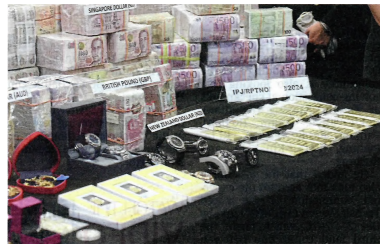
Precious items: The foreign currencies and gold items that were seized being displayed at the press conference at the MACC headquarters in Putrajaya.