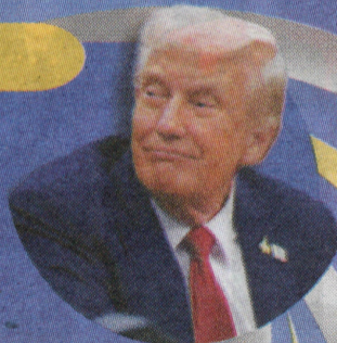
Cambodia Prime Minister Hun Manet

"Millions of people are alive today because of this peace treaty. Two great countries chose the path of prosperity and peace over needless bloodshed and war."