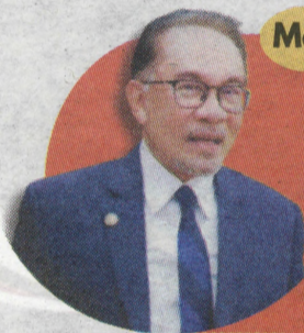
Malaysia Prime Minister Datuk Seri Anwar Ibrahim

"Today marks a historic and profoundly significant moment for our region – a day that reaffirms our shared conviction that peace is always possible when nations have the courage and wisdom to pursue it together."