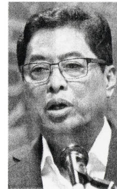
Tan Sri Azam Baki

"In the end, the deputy public prosecutor decided there was no criminal case to be pursued against anyone, whether under the MACC Act 2009, the Penal Code, or governance issues. Therefore, the case is closed," he said.