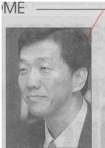
Ong: Per capita income has increased