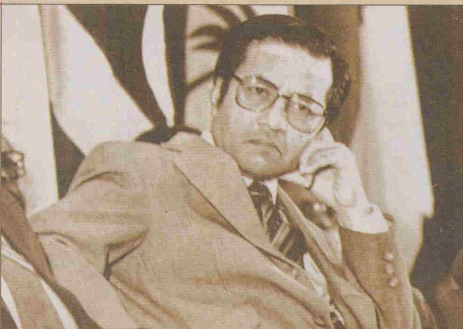
PENSIVE: Dr Mahathir at the launch of Amanah Saham Nasional on Jan 8