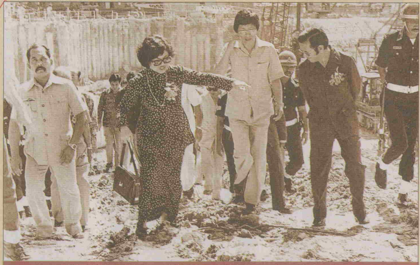
CAREFUL NOW!: Dr Mahathir and Datin Paduka Rafidah Aziz braving the muddy grounds of the ongoing Dayabumi project on Nov 23