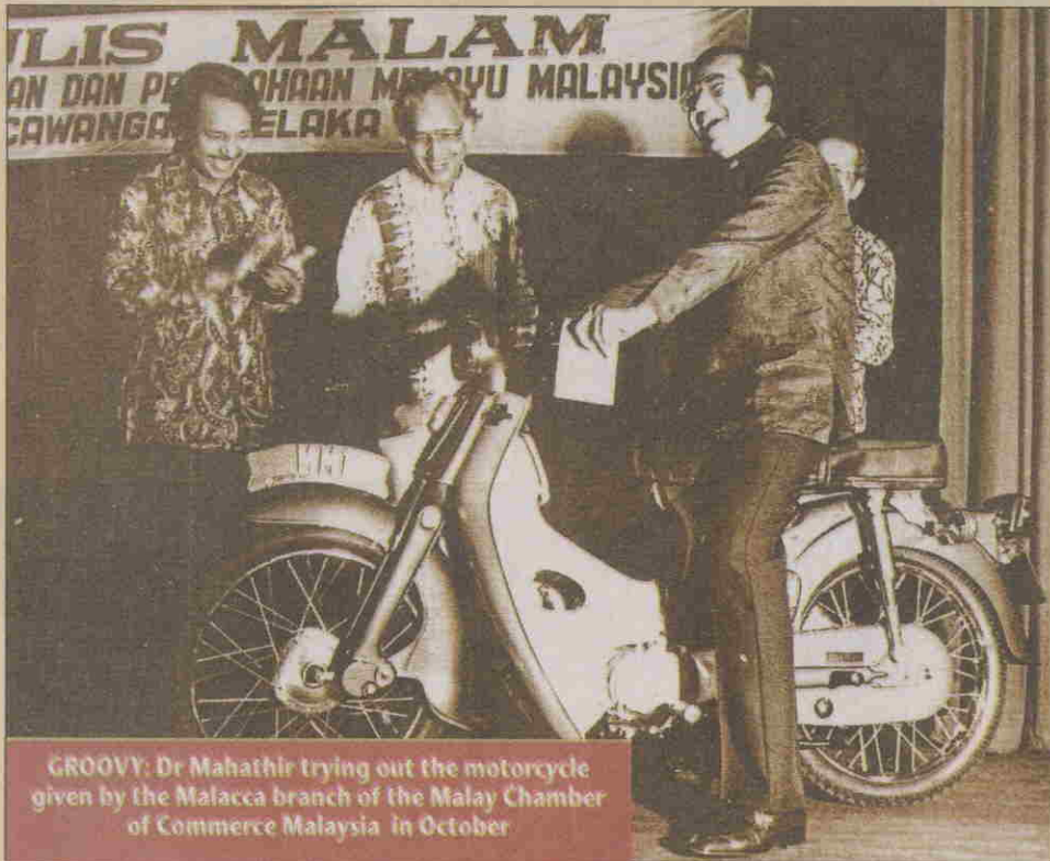
GROOVY: Dr Mahathir trying out the motorcycle given by the Malacca branch of the Malay Chamber of Commerce Malaysia in October