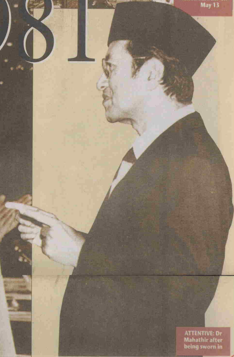
ATTENTIVE: Dr Mahathir after being sworn in