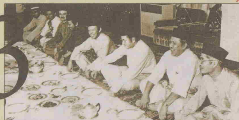
WAITING TO BREAK FAST: Dr Mahathir hosting a 'buka puasa' session at his residence in Jalan Tunku, Kuala Lumpur on June 17. On his right are his deputy, Datuk Musa Hitam, Information Minister Datuk Seri Adib Adam and Minister in the Prime Minister's Department Datuk Abdullah Ahmad Badawi. On his left are Minister of Trade and Industry Tengku Ahmad Rithauddeen and Deputy Minister of Transport Datuk Abu Hassan Omar