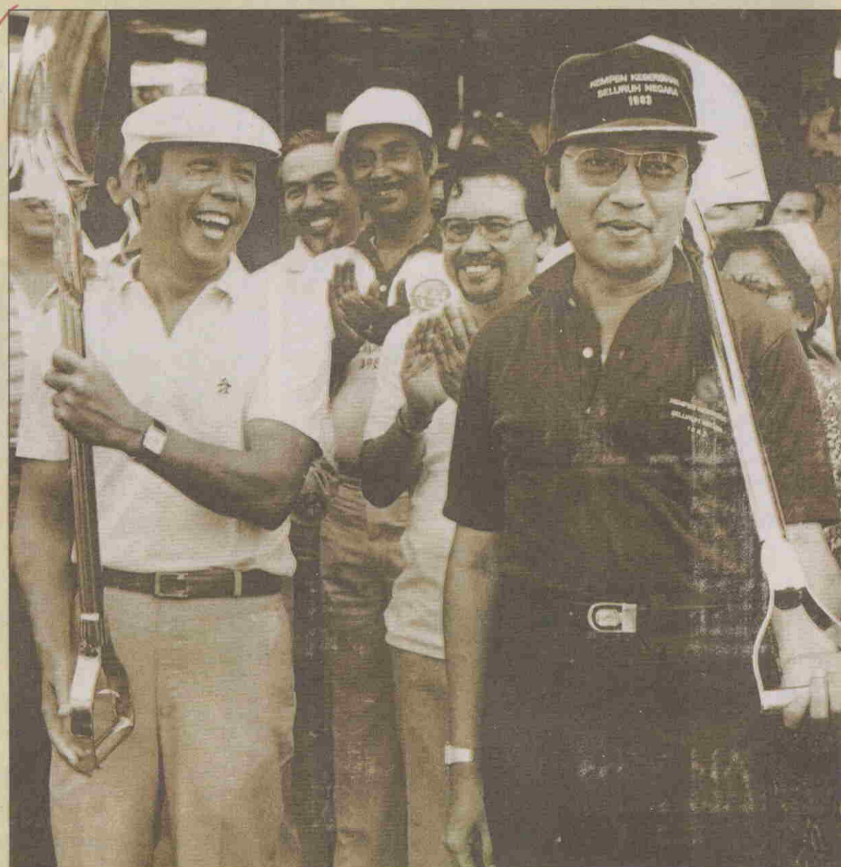
LET'S PLANT SOME TREES: Dr Mahathir and his deputy Datuk Musa Hitam at a tree-planting event around Parliament House on Nov 24