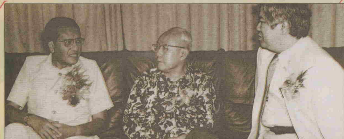
IN DEEP DISCUSSION: Dr Mahathir with Tun Tan Siew Sin and Datuk Dr Neo Yee Pan during the MCA general assembly held at Wisma MCA on Oct 16