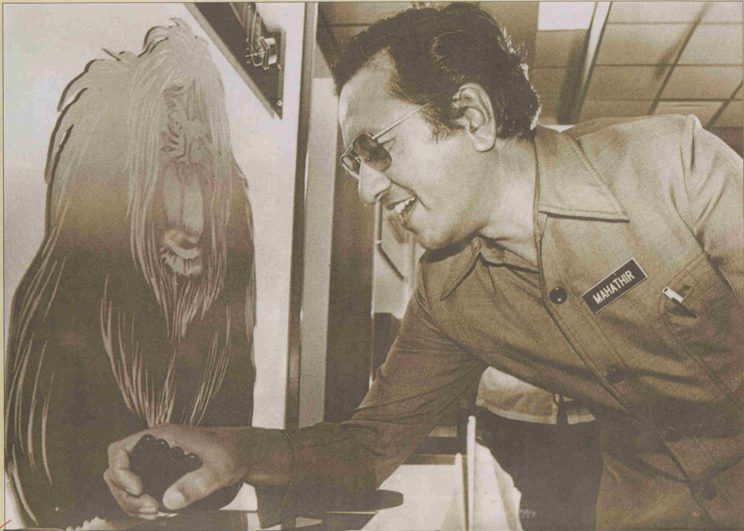
I WILL BEAT YOU!: Dr Mahathir is determined to beat the electronic gorilla in arm wrestling at Universiti Teknologi Malaysia's Electrical Science Museum in October 1983. He succeeded, of course