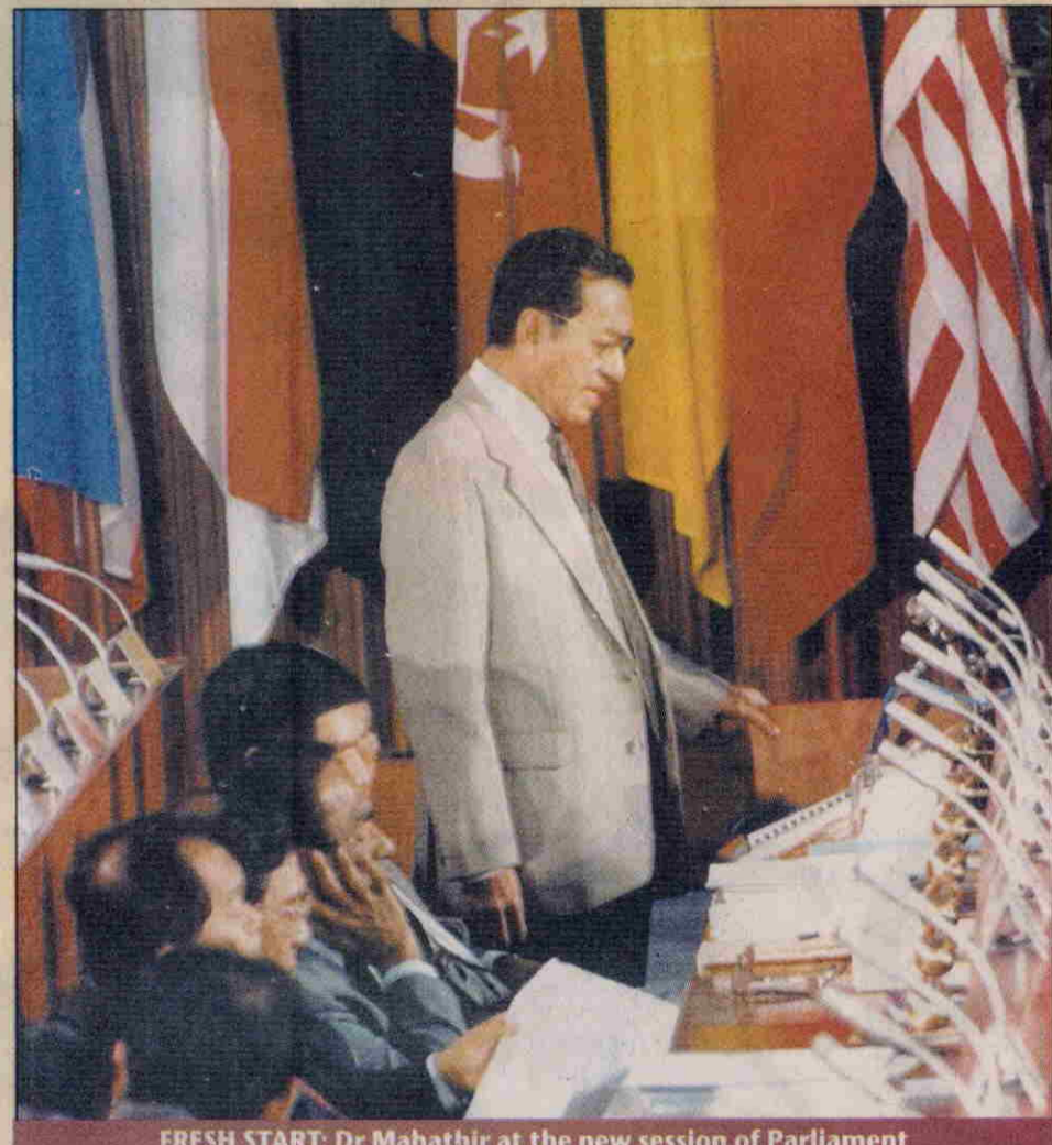
FRESH START: Dr Mahathir at the new session of Parliament