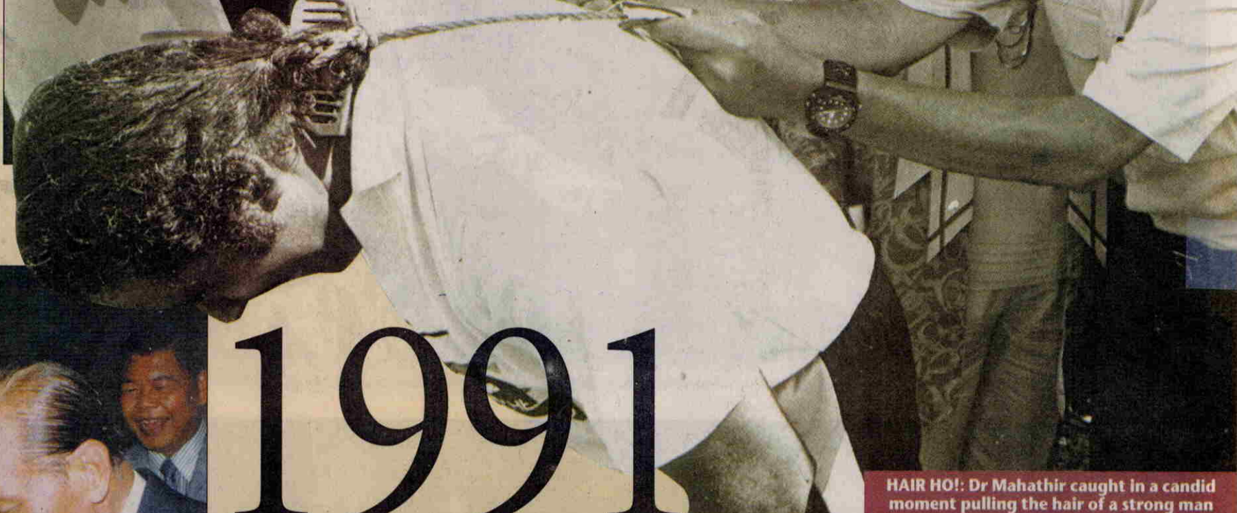
HAIR HO!: Dr Mahathir caught in a candid moment pulling the hair of a strong man