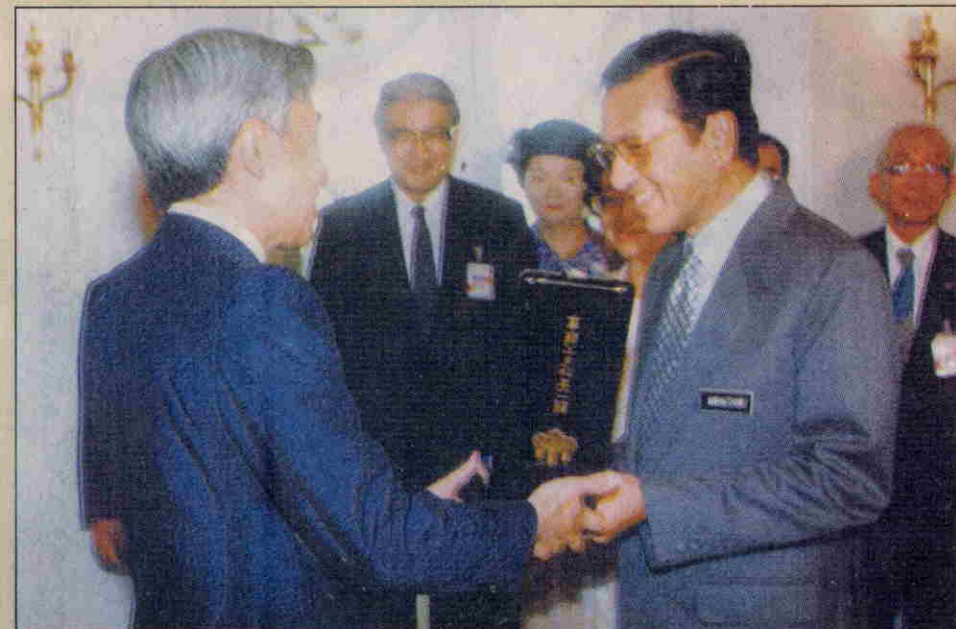
MARK OF DISTINCTION: Dr Mahathir receiving the Grand Cordon of the Order of the Rising Sun award from Japanese Emperor Akihito at Carcosa Seri Negara. Looking on is Empress Michiko