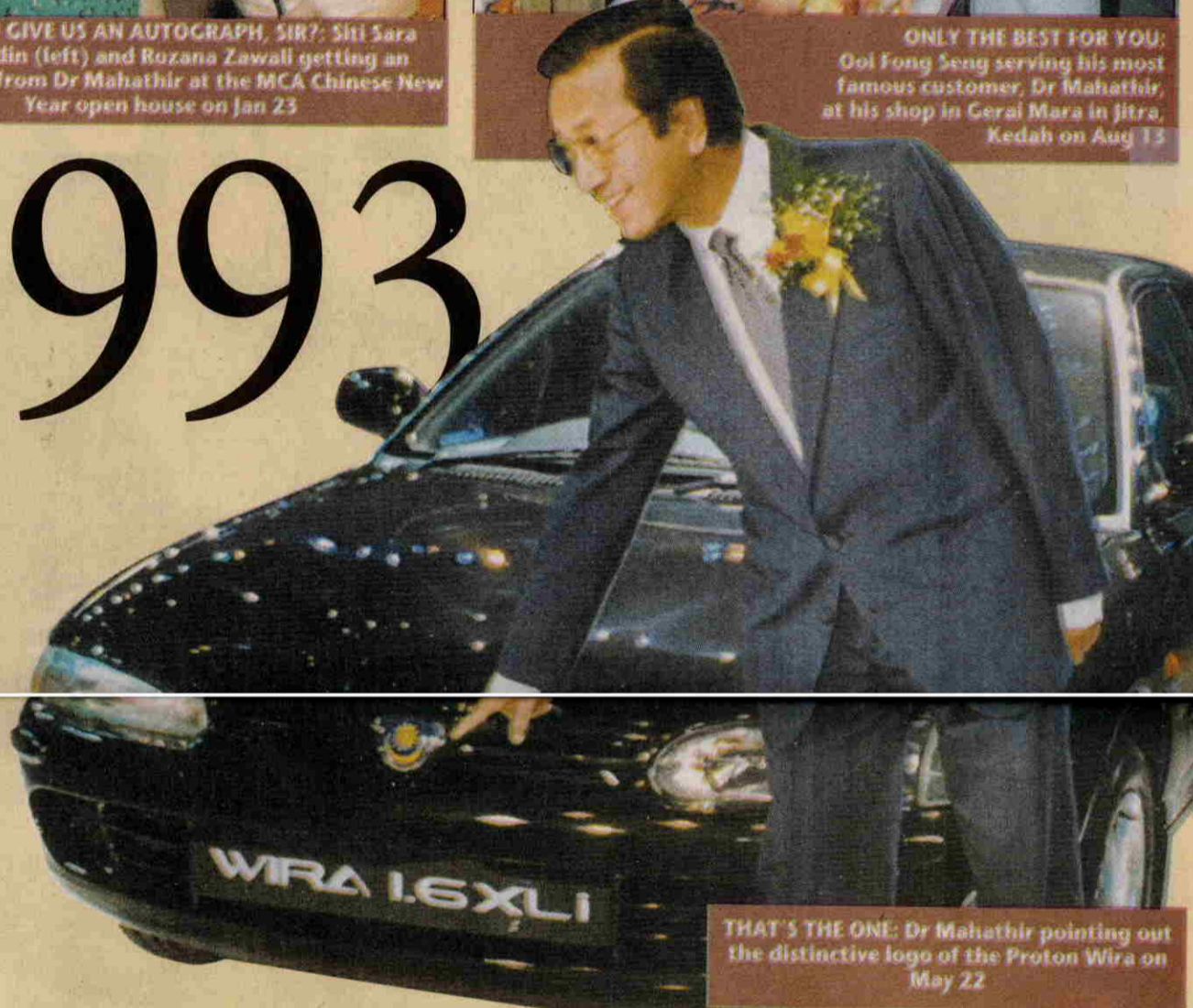
THAT'S THE ONE: Dr Mahathir pointing out the distinctive logo of the Proton Wira on May 22