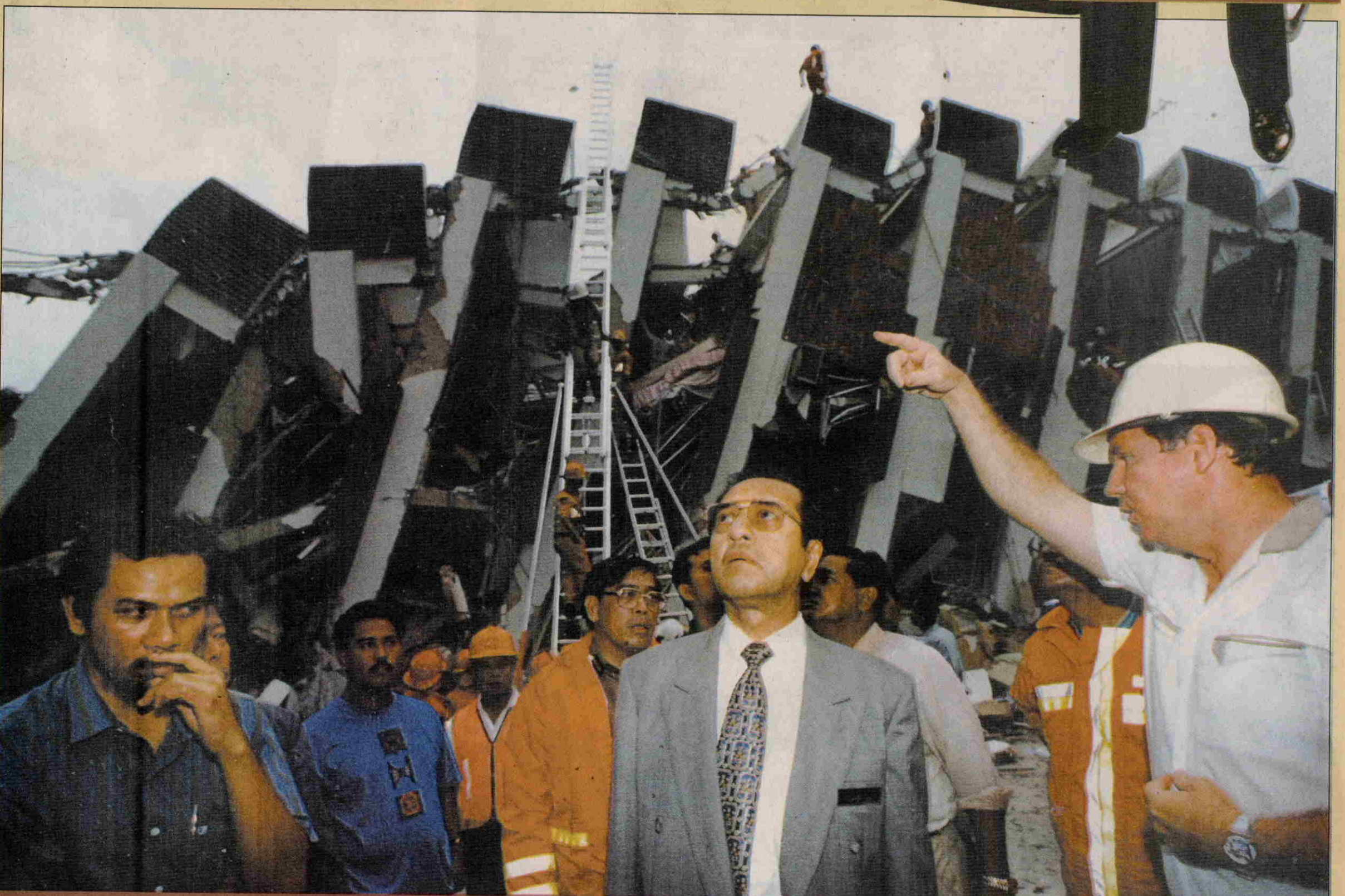
TRAGEDY: Dr Mahathir being briefed at the site of the Highland Tower tragedy on Dec 11