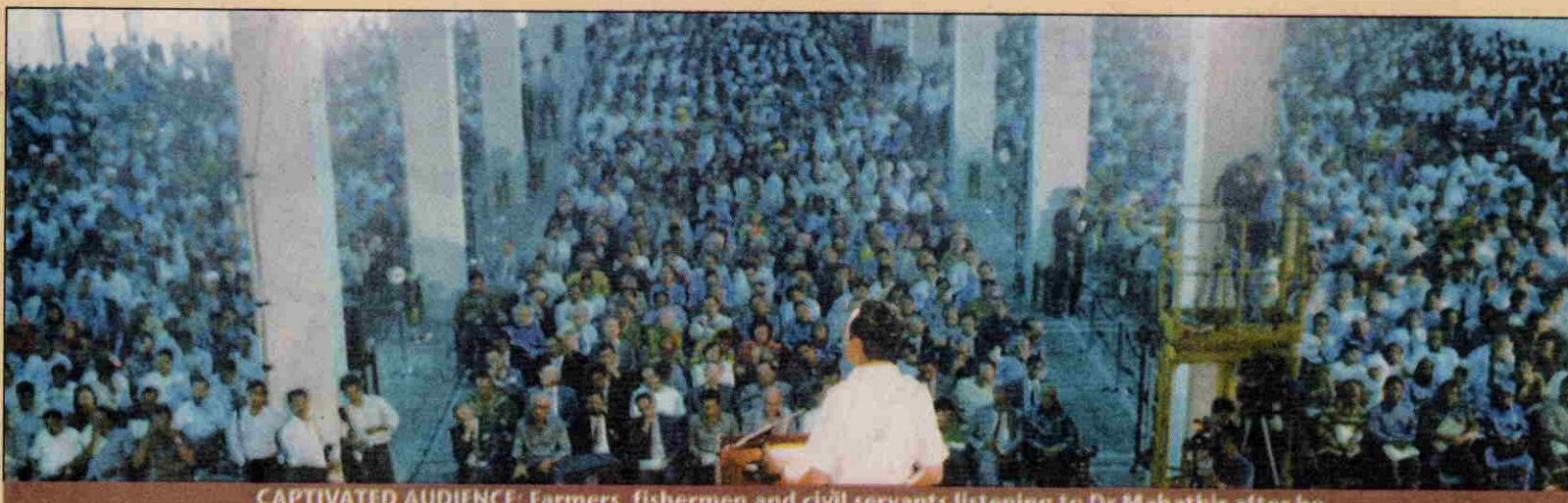
CAPTIVATED AUDIENCE: Farmers, fishermen and civil servants listening to Dr Mahathir after he launched the National Agriculture Policy at PWTC on Feb 1