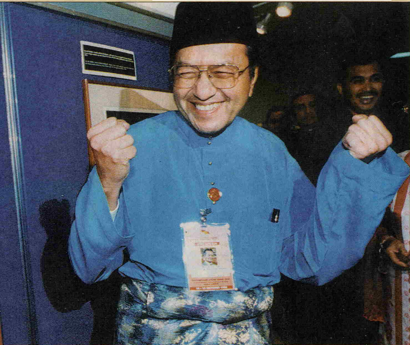
MALAYSIA BOLEH! Dr Mahathir recalling the enthusiasm he showed in the photograph of him addressing the 1995 Umno General Assembly at the New Straits Times photo exhibition on Umno's 50th anniversary