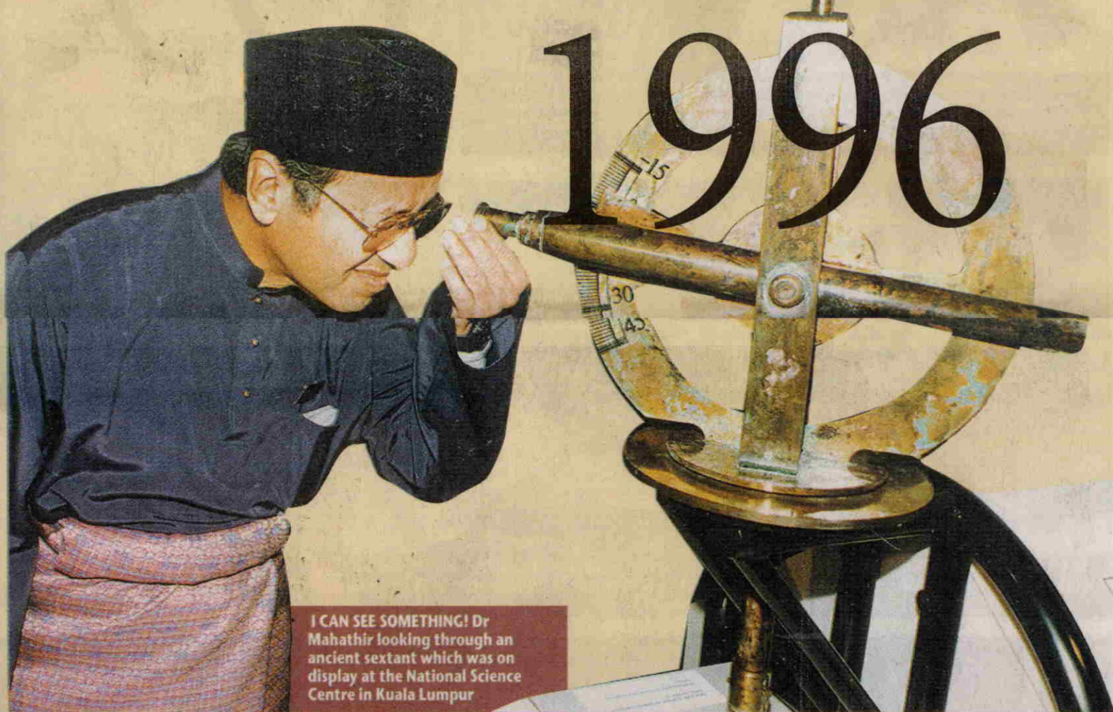
I CAN SEE SOMETHING! Dr Mahathir looking through an ancient sextant which was on display at the National Science Centre in Kuala Lumpur