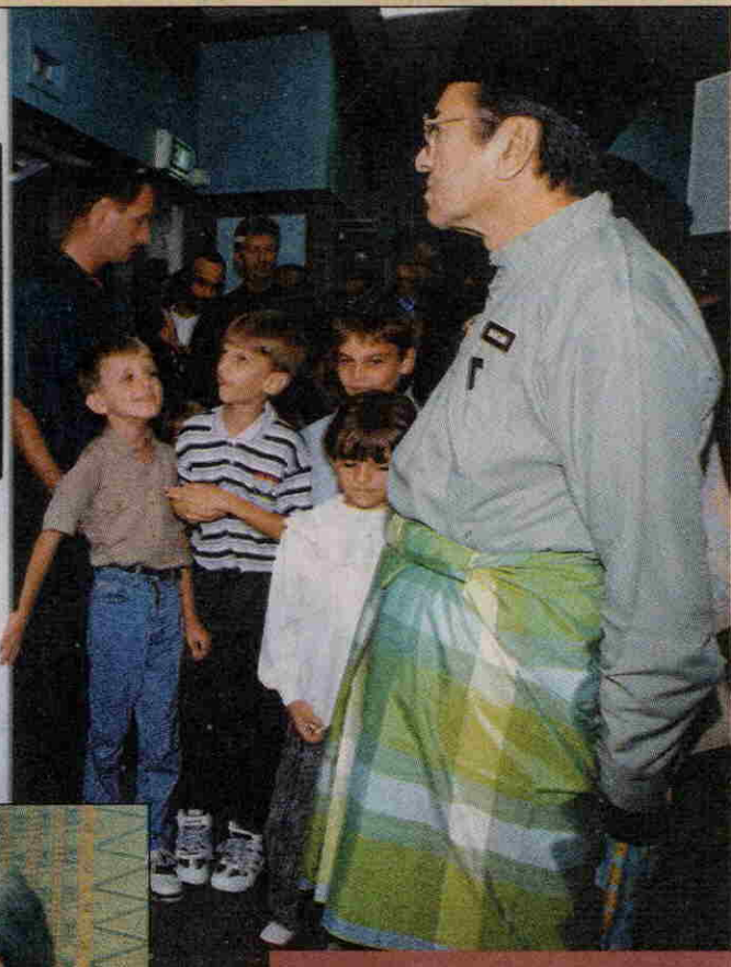
CONCERNED: Dr Mahathir looking at posters on display after launching the Global Humanitarian Appeal for the rebuilding of Bosnia-Herzegovina