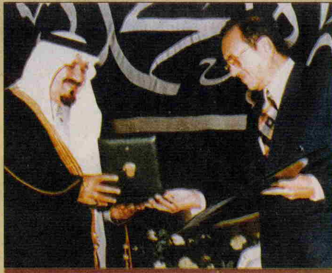
ISLAMIC EMINENCE: Dr Mahathir receiving the King Faisal International Prize for Service to Islam from Prince Sultan bin Abd Al Aziz, Second Deputy Premier of Saudi Arabia