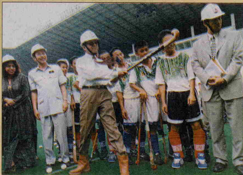
GO FOR GOAL: Dr Mahathir trying his hand at hockey at the Bukit Jalil hockey stadium during his visit to the National Sports Complex to check the progress of the 1998 Commonwealth Games main venue. With him were Youth and Sports Ministry Parliamentary secretary Datuk Shahrizat Abdul Jalil, Deputy Minister