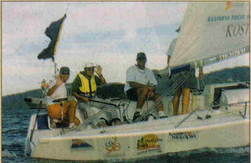
GOOD SPORT: Dr Mahathir participating in the Malaysia Challenge during Lima '97, Langkawi