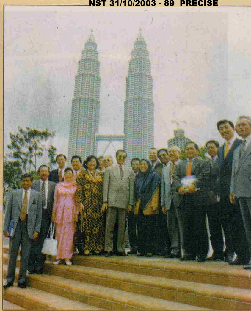
ONE FOR THE ALBUM: Dr Mahathir with some Cabinet Ministers and officials from Petronas and KLCC at the KLCC Park