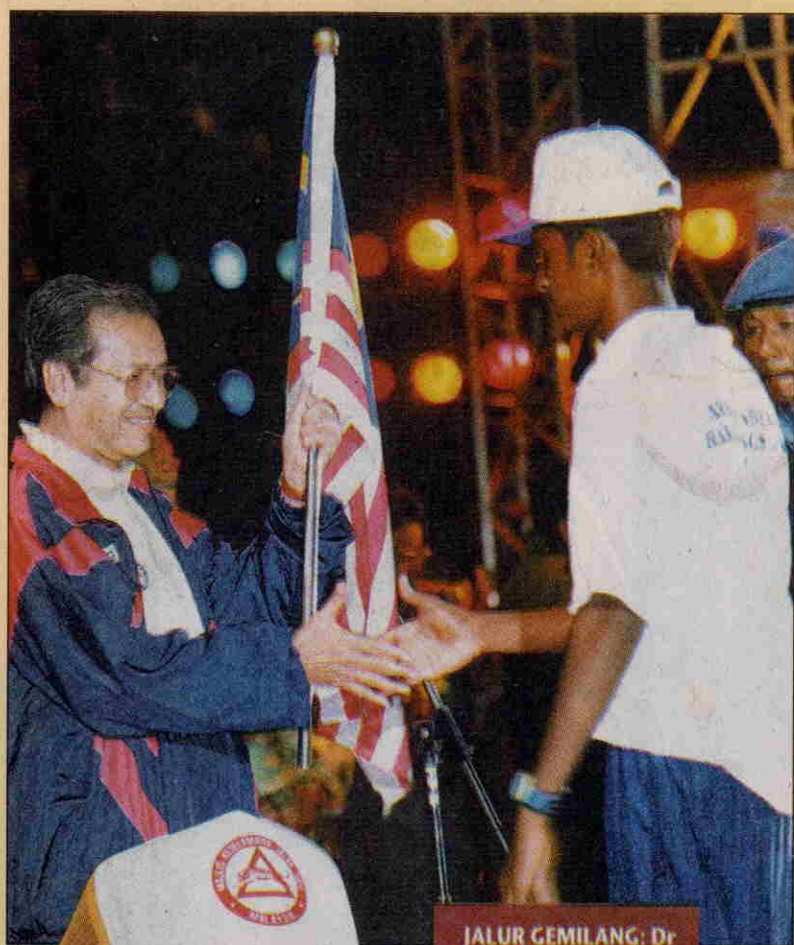
JALUR GEMILANG: Dr Mahathir receiving the national flag from one of the participants in a cross-country run. The Malaysian flag was officially named 'Jalur Gemilang' at midnight in conjunction with the 40th National Day celebrations