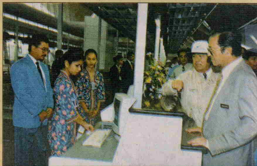
CHECK-IN: Dr Mahathir visiting key areas of the Kuala Lumpur International Airport to ensure the infrastructure for the 1998 Commonwealth Games