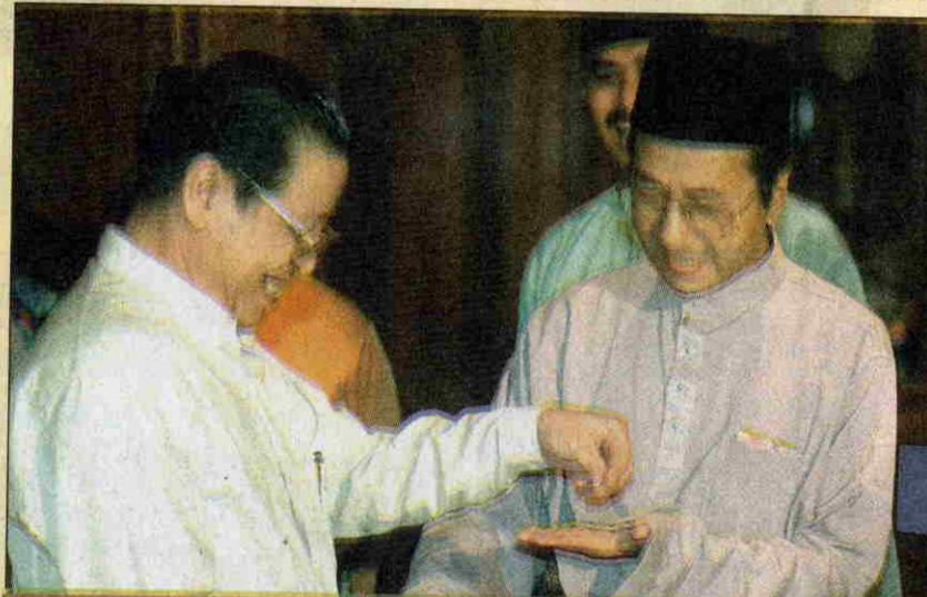
HERE YOU ARE: Democratic Action Party secretary-general Lim Kit Siang giving Dr Mahathir 10 sen after losing a wager. Lim wrongly predicted that the general election would be called a year before