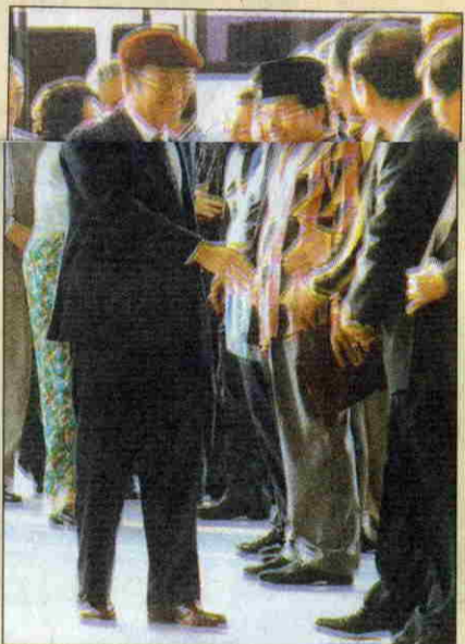
WELCOME BACK: Dr Mahathir being greeted by well-wishers upon his arrival at the Kuala Lumpur International Airport after attending the World Economic Forum in Davos