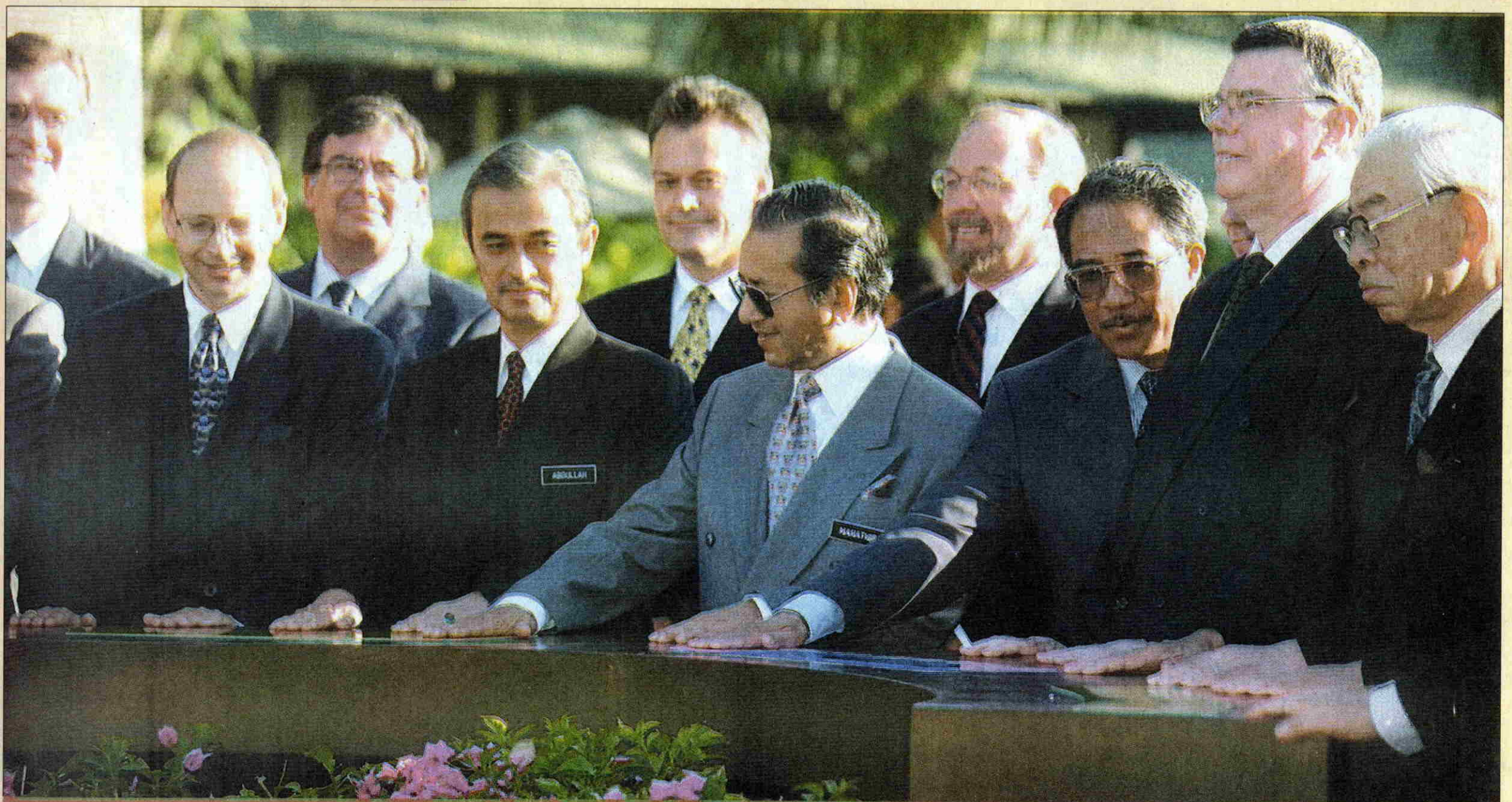
TOGETHER NOW: Dr Mahathir and Deputy Prime Minister Datuk Seri Abdullah Ahmad Badawi (left) placing their palms on top of a special rostrum together with members of the Third International Advisory Panel to mark the official launch of Cyberjaya