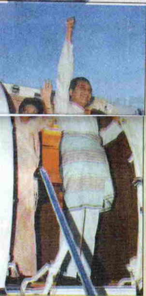
WITH SPIRIT: Dr Mahathir shouting 'Bersatu' in response to cheers and applause from the crowd at the Sultan Ismail Petra in Pengkalan Chepa after a half-day visit to Kelantan