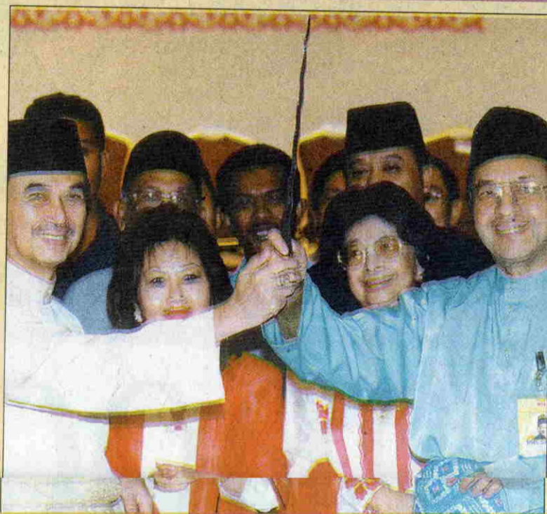
ALL FOR ONE: Dr Mahathir and Datuk Seri Abdullah Ahmad Badawi holding a 'keris' to signify their co-operation