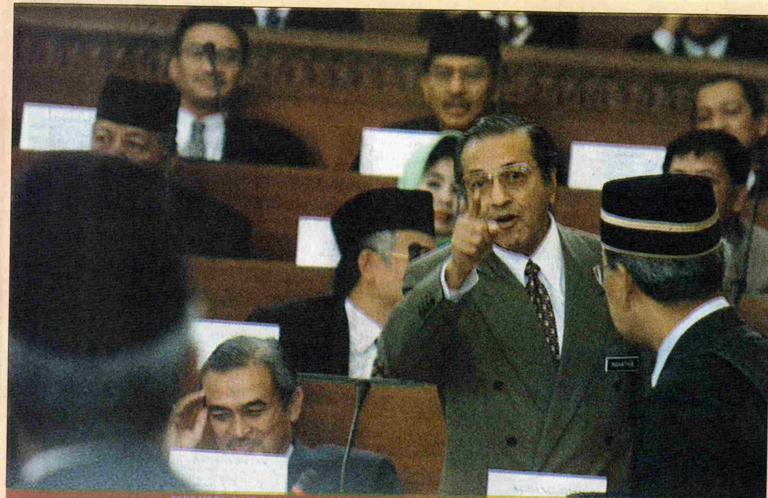
TAKE NOTE: Dr Mahathir stressing a point to members of the Opposition in Parliament