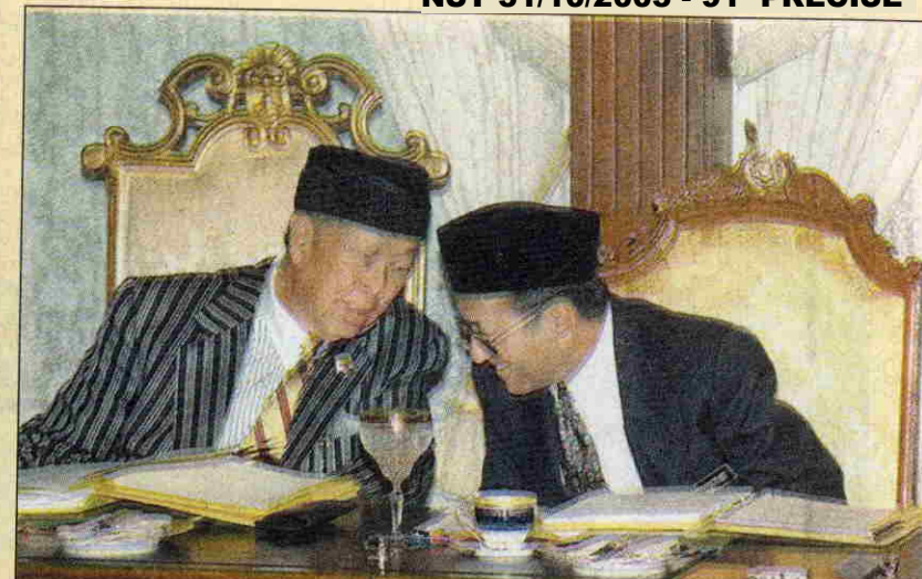
SHARING A MOMENT: Dr Mahathir discussing a matter with Yang di-Pertuan Agong Sultan Salahuddin Abdul Aziz Shah before the 181st Rulers' Conference at Istana Negara