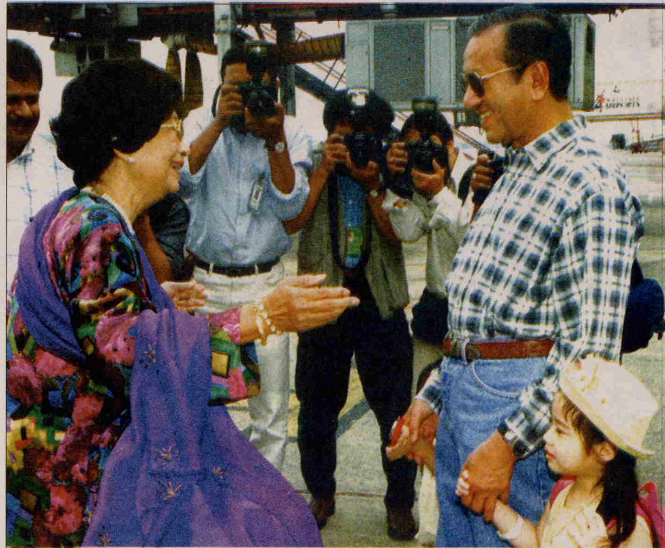
I MISS YOU: Dr Mahathir welcoming Dr Siti Hasmah on her return from Iraq at the Sultan Abdul Aziz Shah airport in 2000. With him are their grandchildren

"It is a small house. It is what we will be happy in. And it is home where our children and grandchildren can visit," she said with a twinkle in her eyes.