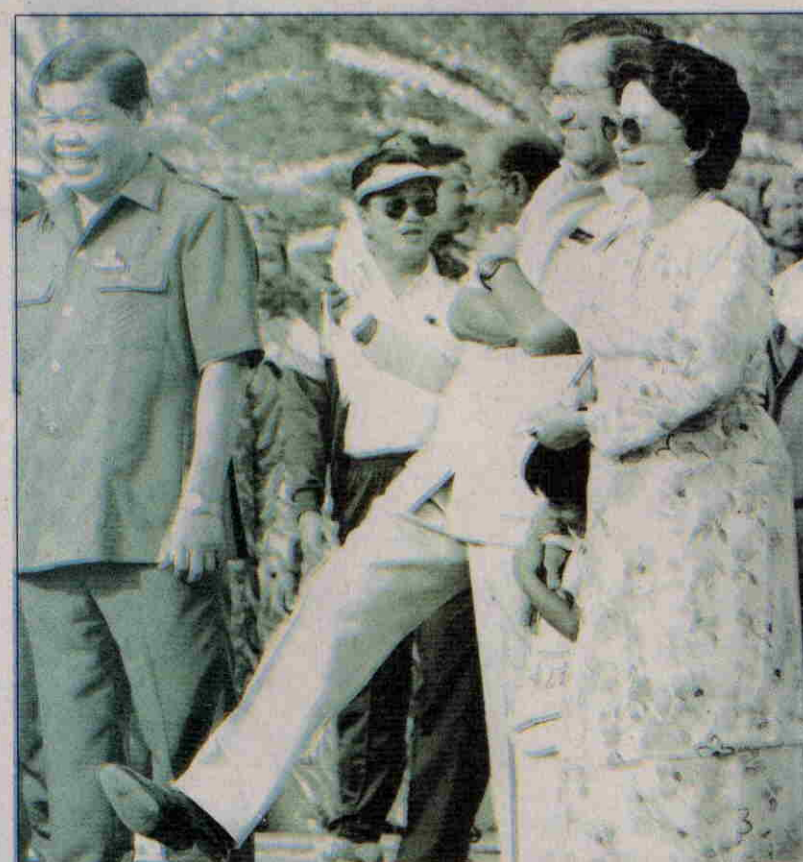
KEEPING PACE: Dr Mahathir having fun at the Information Ministry's Family Day in 1989. On the left is Information Minister Datuk Mohamed Rahmat