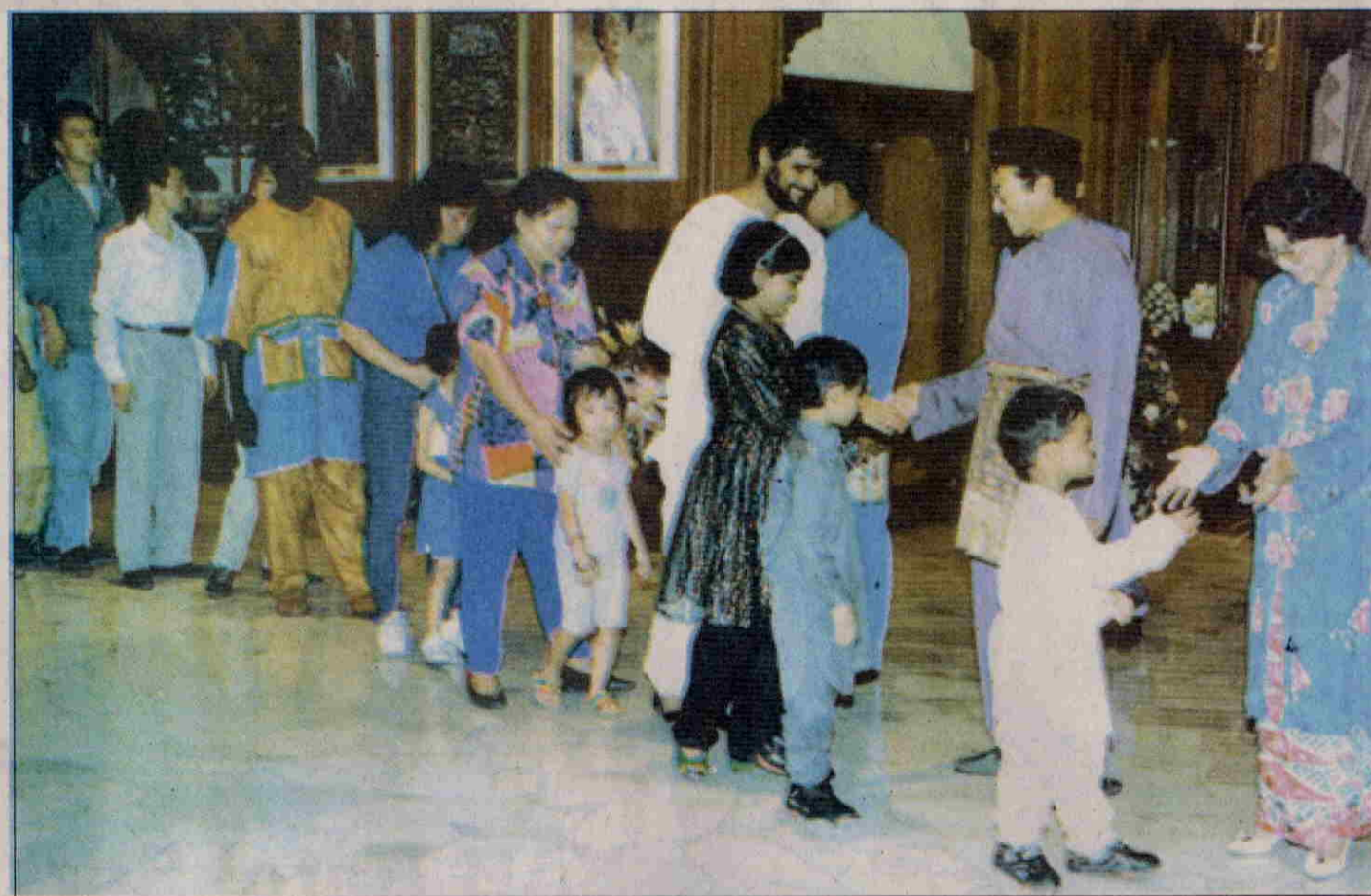
WELCOME: Visitors wishing Dr Mahathir and Dr Siti Hasmah at their Hari Raya open house in 1994