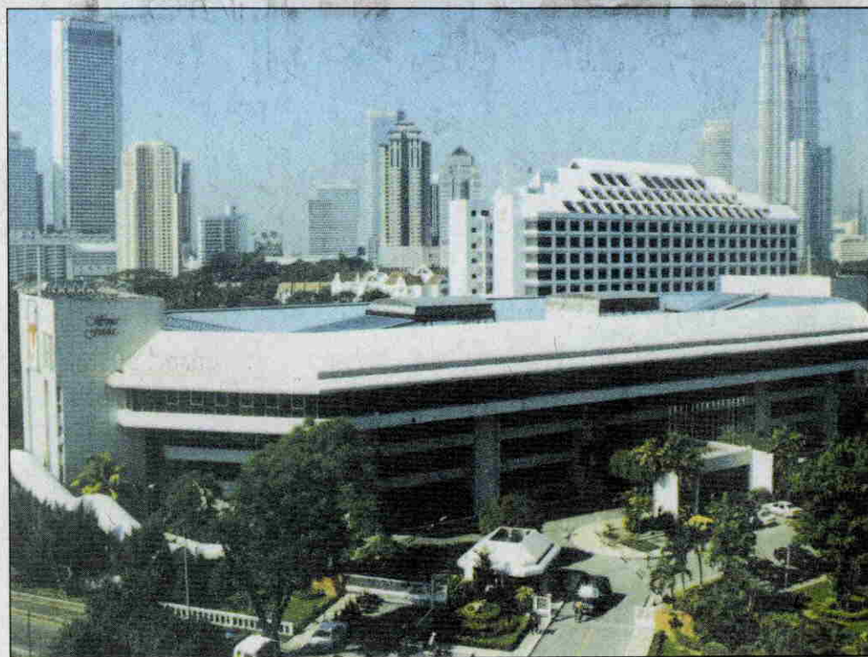
NEW CORPORATE IMAGE: Felda's office against the backdrop of the Kuala Lumpur skyline