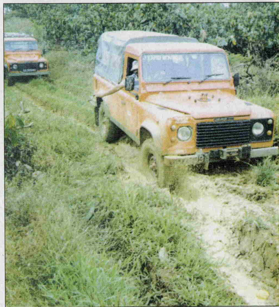
STARTING OUT: Officers inspecting the land