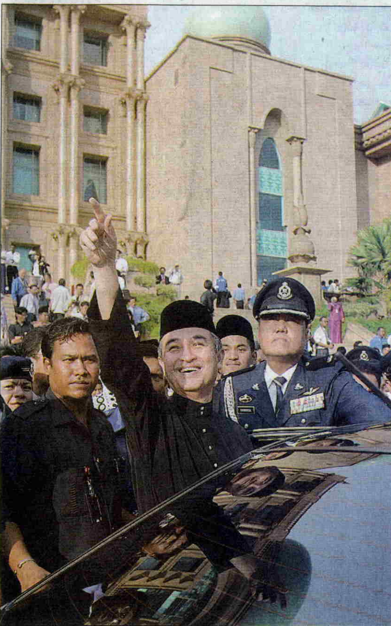
SMOOTH TRANSITION: Tuanku Syed Sirajuddin leaving the Balairong Seri after the swearing-in ceremony accompanied by the former and new Prime Ministers. Walking behind is Tuanku Fauziah.