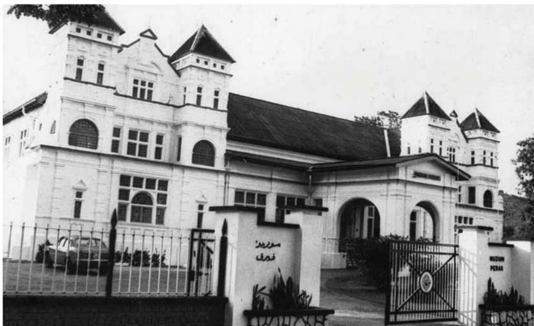
The Perak Museum in Taiping. The many Malay manuscripts from various places in the Malay Archipelago and the various courts in the Malay peninsula are seen by European collectors as a mirror of Malay society.

Overbeck was also a collector of Malay books. His views were distorted had we not read his sub-