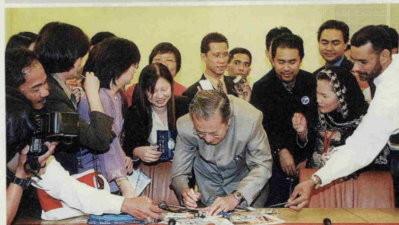
Reporters clamouring to get Dr Mahathir's autograph after his last press conference as Prime Minister at his Putrajaya office this afternoon.

going to retire doesn't mean you should take it easy," said Entrepreneur Development Minister Datuk Nazri Aziz.