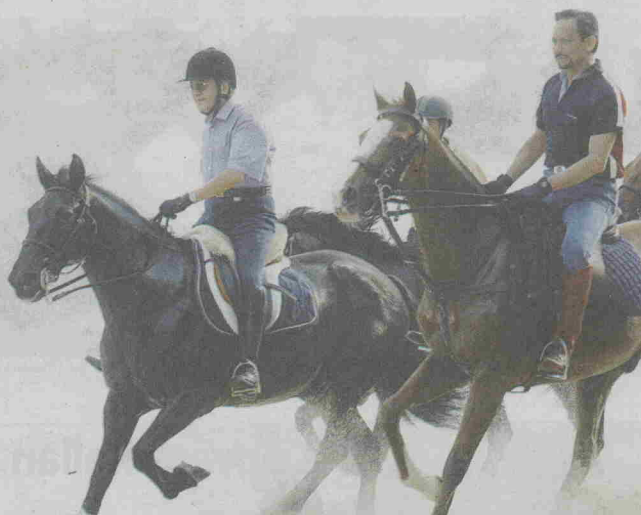
The sportsman-side of the PM is seen here (above) during a horse ride with Sultan of Brunei, Sultan Hassanal Bolkiah, in Penang while a portrait (below) catches the man in a pensive mood.

In silent homage, mother, son and niece raised their arms in tribute.