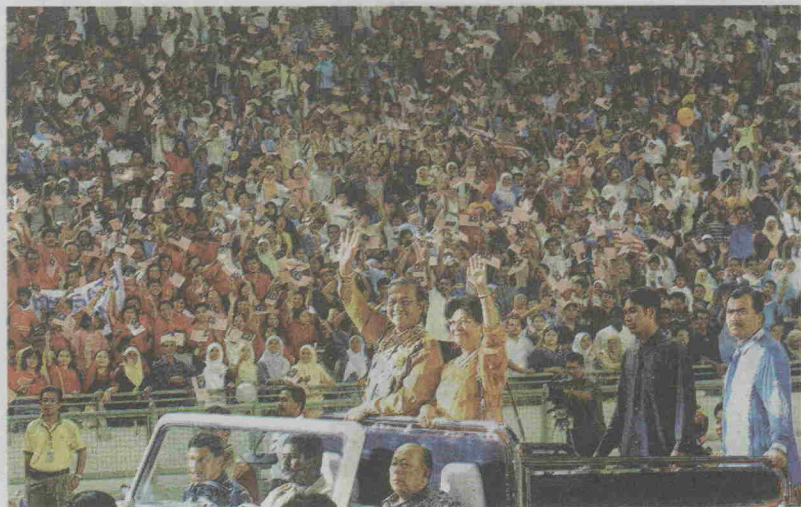
Left: Dr Mahathir and his wife Dr Siti Hasmah Ali waving to the thousands who turned up during the Nation We Care event in Bukit Jalil to show their support for him.