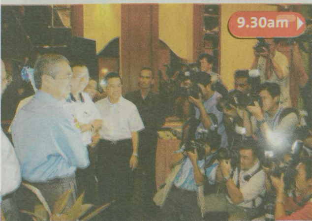
Pak Lah goes down to the hotel ballroom to launch the Agenda of Work for Penang with Tan Sri Koh Tsu Koon.