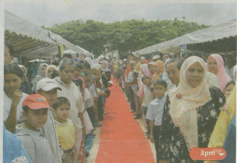
A red carpet welcome awaits Pak Lah at the padang in Parit Buntar after he visits the BN Operations Centre there.