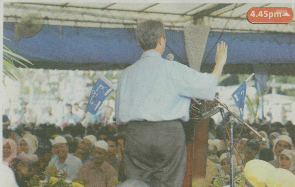
From Parit Buntar, he goes to Nibong Tebal where he addresses another massive crowd gathered under huge tents in the public field.