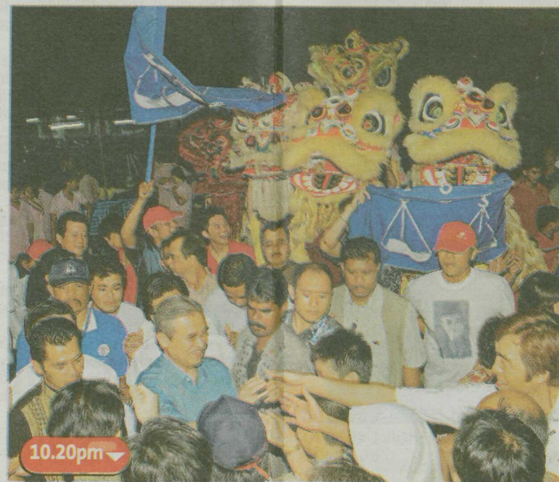
Arriving at an MCA-Gerakan dinner at Jalan Dua, Kepala Batas, he is greeted by 4,000 people. This followed another dinner at SJK(C) Mah Hua hosted by residents of Kampung Selamat in the Pinang Tunggal state seat.