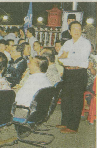
ists. Many people, who had finished Pak Lah.