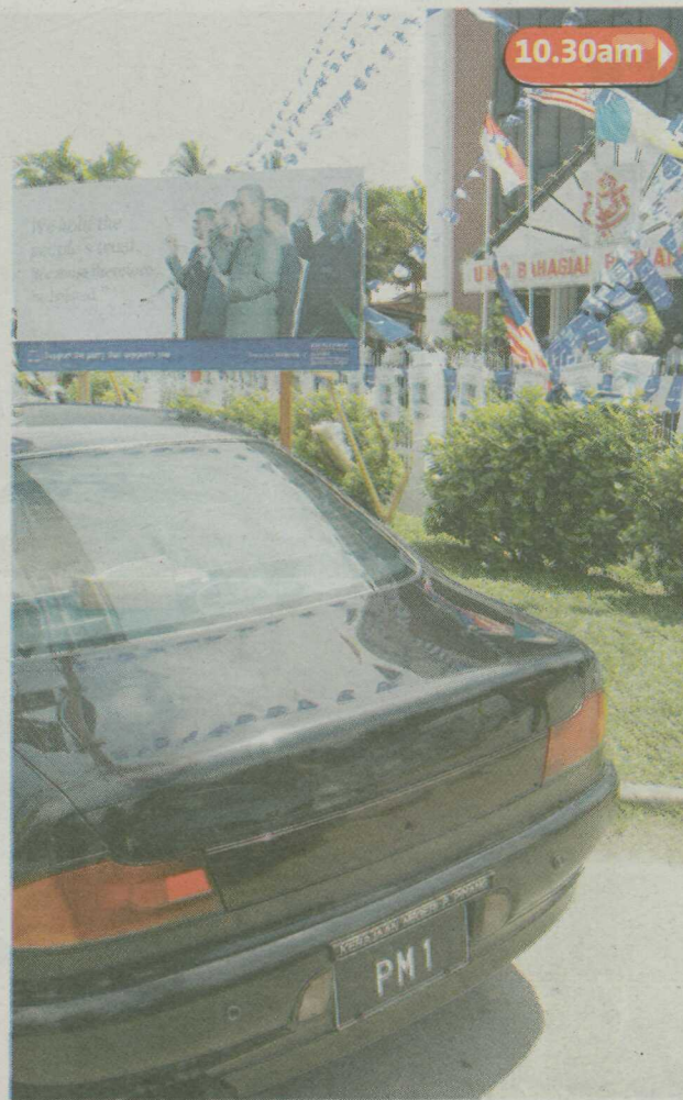
His car takes him to the Permatang Pauh Umno division building in Sungai Semambu for a ceramah .