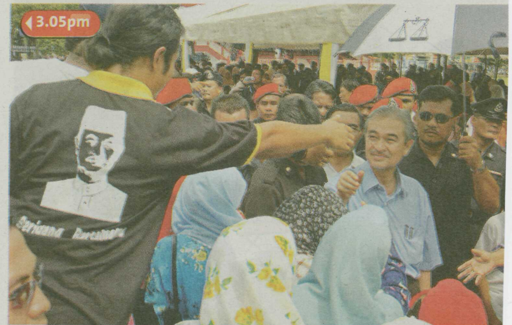
He is greeted by such a huge crowd that it takes him 20 minutes to reach the stage to deliver his speech. This young supporter proudly wears a T-shirt with Pak Lah's image and the words: Berjuang Bersama Mu (Together in the struggle).