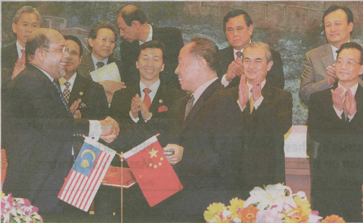
SIGNED AND SEALED: Foreign Minister Datuk Seri Syed Hamid Albar and his Chinese counterpart Li Zhaoxing exchanging copies of the signed MoUs in Beijing yesterday. Abdullah, Wen (right) and Housing and Local Government Minister Datuk Seri Ong Ka Ting were among those who witnessed the event.