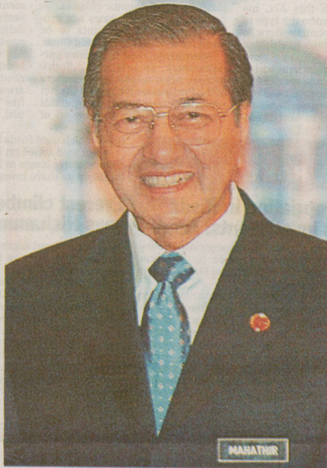
Mahathir ... Malaysia's longest serving prime minister will hand over office to his deputy on Friday.

Tun Razak named his deputy, Tun Dr Ismail Datuk