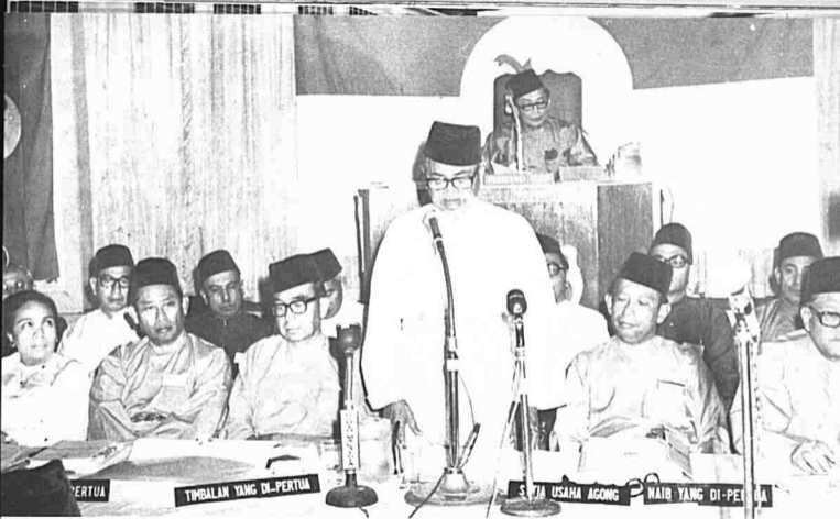
UMNO General Conference, 23/24 January 1971. Tunku Abdul Rahman's Farewell Address before retiring as President UMNO.