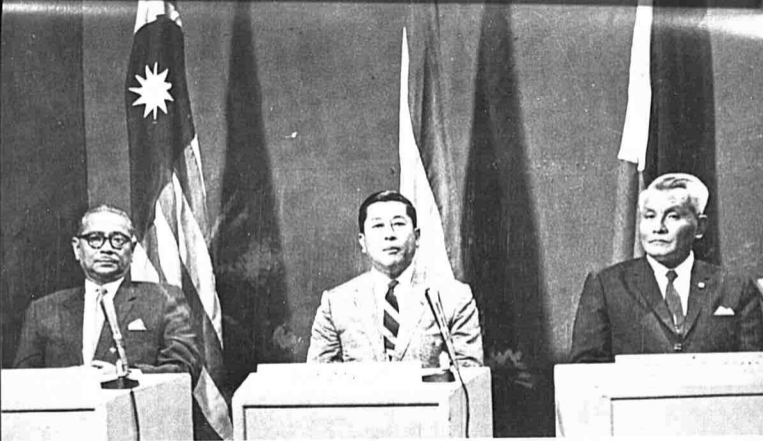
Formation of ASA