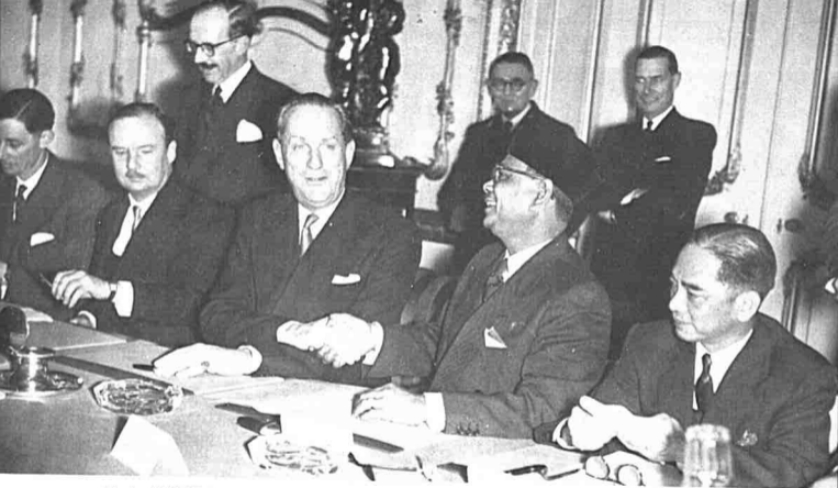
Tunku Abdul Rahman shaking hands with Mr. Alan Lennox-Boyd during the final meeting of the Federation of Malaya Constitutional Conference at Lancaster House. The Report of the Conference was signed during this final meeting — 8th February 1956.