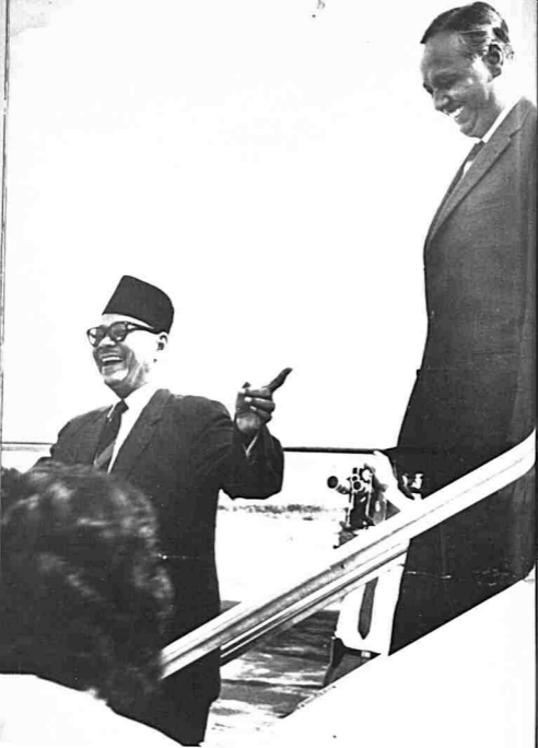
Returning from London — Tunku Abdul Rahman and Tun Sambanthan. "See the new man, Sambathan; how smart and handsome he now looks?"