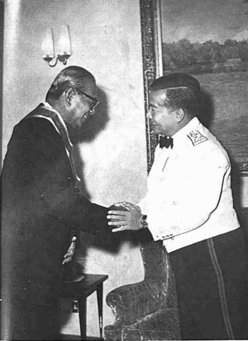
Prince Sihanouk warmly shook Tunku Abdul Rahman's hand after bestowing Highest Order of Cambodia.