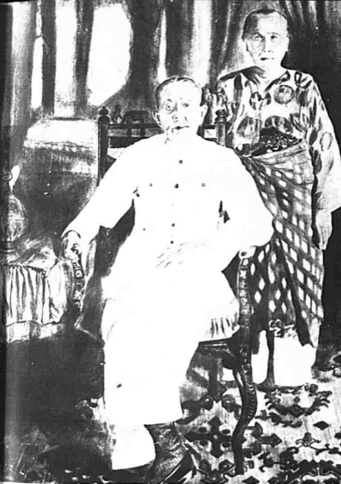
Tunku Abdul Rahman's parents — Sultan Abdul Hamid and his consort.