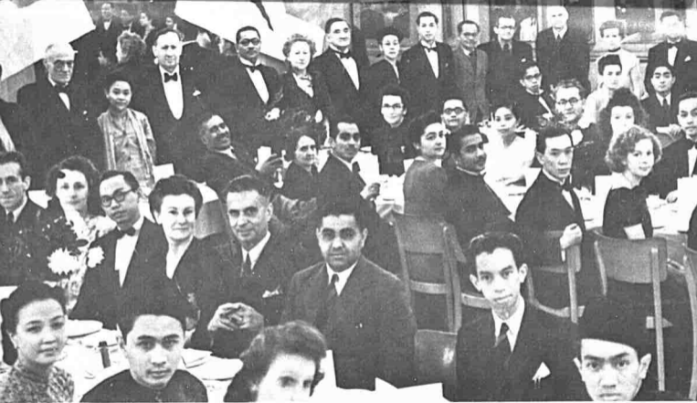
Malay Society Dinner in London 1947.