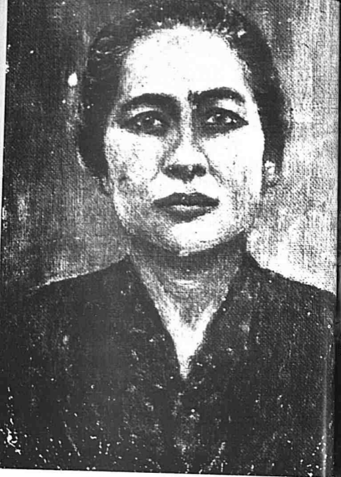
Tunku Abdul Rahman's mother at the age of 55.