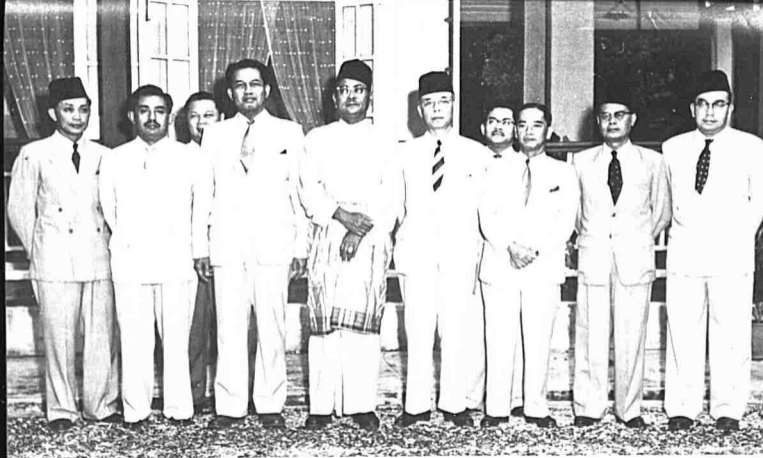
Delegation to London for Merdeka Talks.