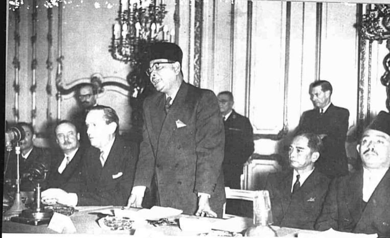
Malaya Constitutional Conference — Final Meeting.