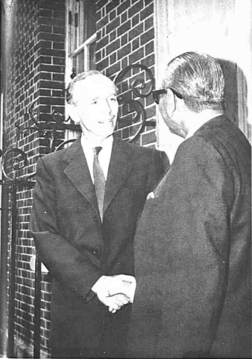
Sir Alec Douglas Home and Tunku Abdul Rahman.