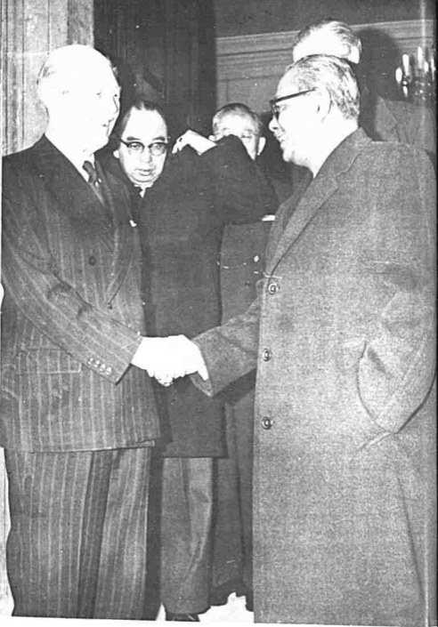
MacMillan, Razak and Tunku Abdul Rahman.