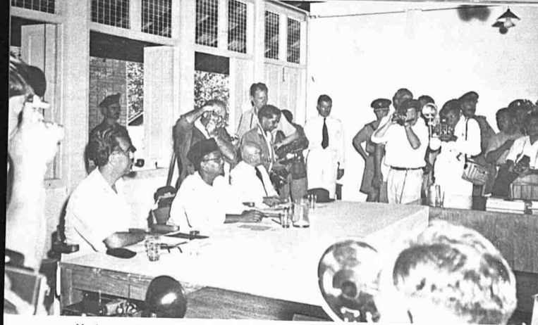
Meeting with Chin Peng, Tunku Abdul Rahman, David Marshall and Tun Tan Cheng Lock at Baling Talks.