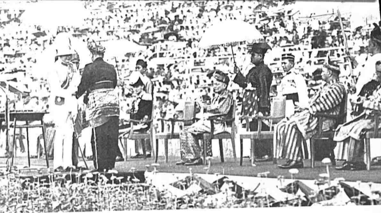
Representative from Her Majesty The Queen handing over the copy of proclamation of Independence to Tunku Abdul Rahman.