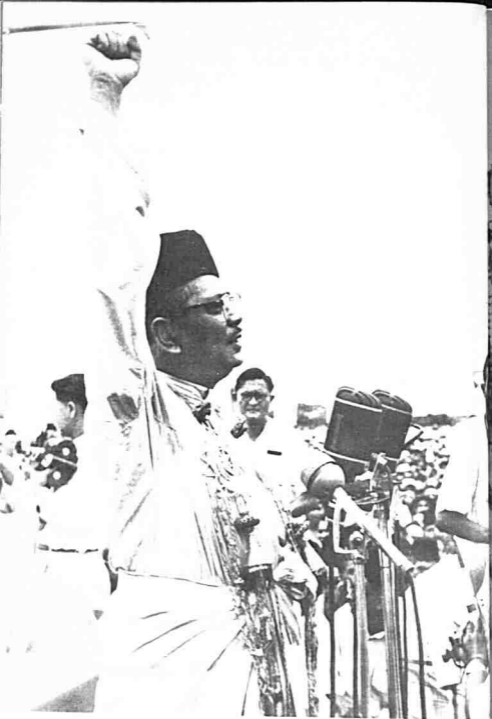
MERDEKA! The shout of Independence