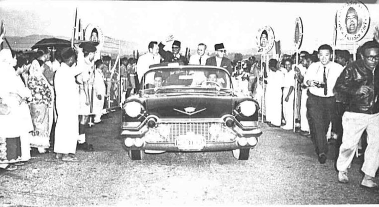
Returned in triumph after London talks on Malaysia. Left to Right: Lee Kuan Yew, Tunku Abdul Rahman, Tun Tan Siew Sin and Tun Abdul Razak.