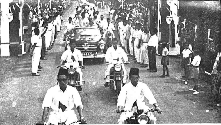
Welcoming Tunku Abdul Rahman to Malacca, after the successful London talks on Independent Malaya.