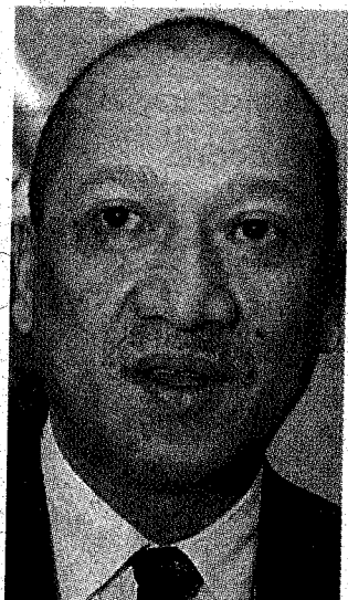
Nazri: 'He called me Brutus, now who is Brutus?'