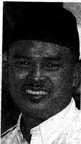
Idris: 'He must have found it difficult to let go'