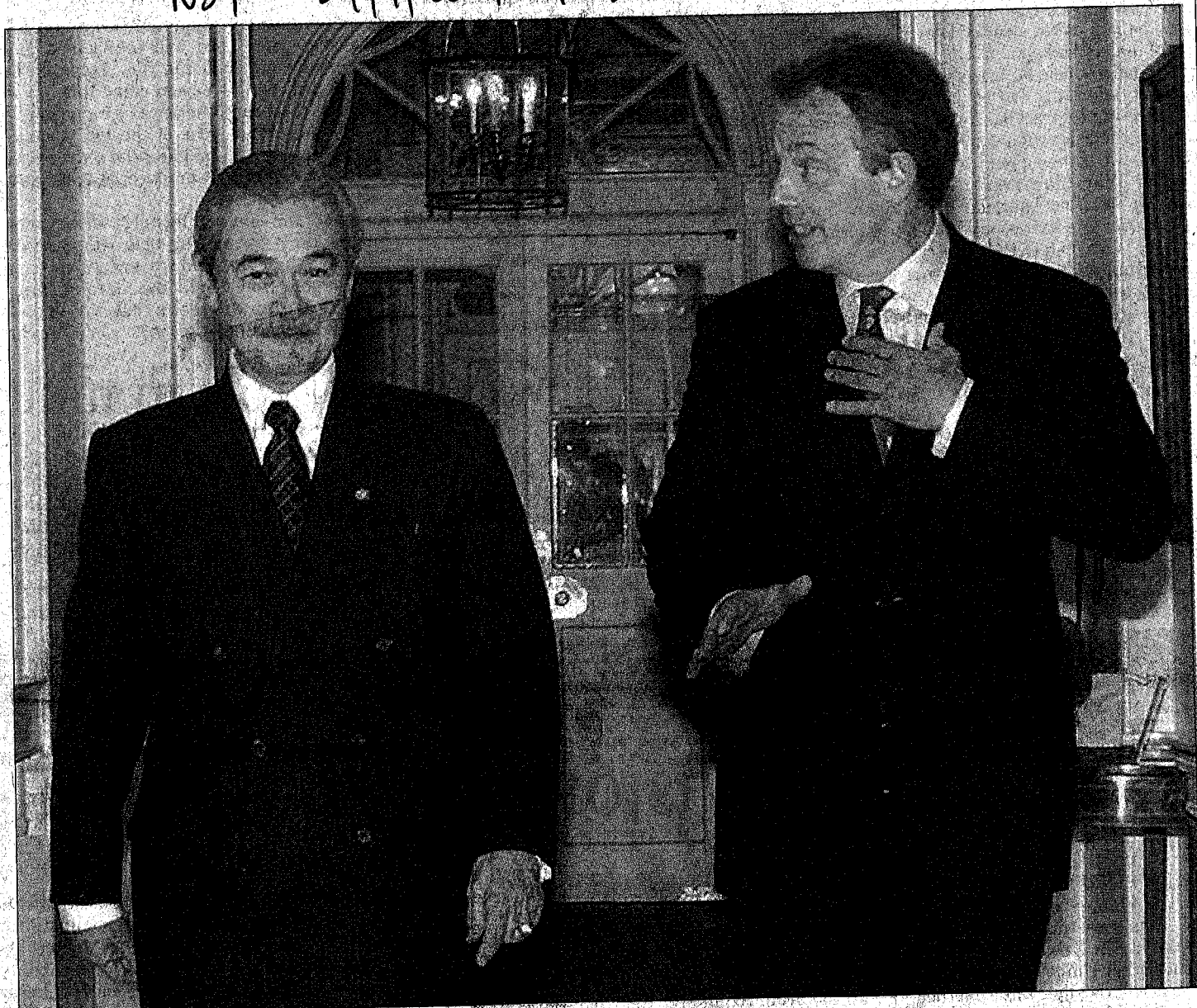
WELCOME: Abdullah with Blair at No 10 Downing Street.

After giving his insight into the policies and values that underpin Malaysia's success, he was asked by several Muslims in the audience if Malaysia could be a catalyst for development in the rest of the Muslim