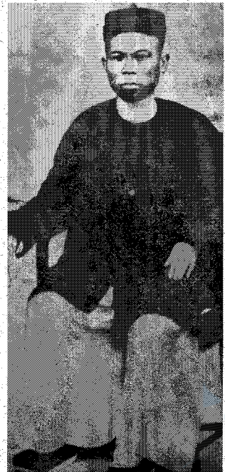
Yap Ah Loy has been excluded from textbooks

"Research showed that students were not interested in history, they had difficulty understanding facts and were only memorising information without appreciating the subject. We decided to consolidate the facts to make the subject less boring," she said.