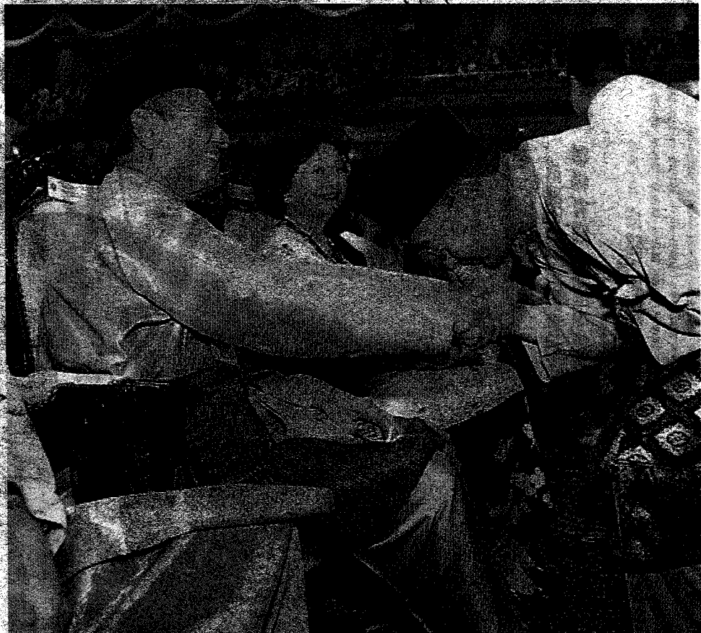
ADORED FIGURE Mukhriz kissing his father's hand when the former Umno president took his seat at the assembly hall at the PWTC yesterday. Dr Mahathir and his wife Tun Dr Siti Hasmah were special guests at the assembly.

AT LAST year's Umno general assembly - Tun Dr Mahathir Mohamad's final appearance as party president - he was mobbed by members everywhere he went during the three-day meeting.