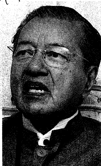
Dr Mahathir: Did a great job getting Malaysia out of the financial crisis

tion with an impressive record at home and abroad. It is a great national asset.