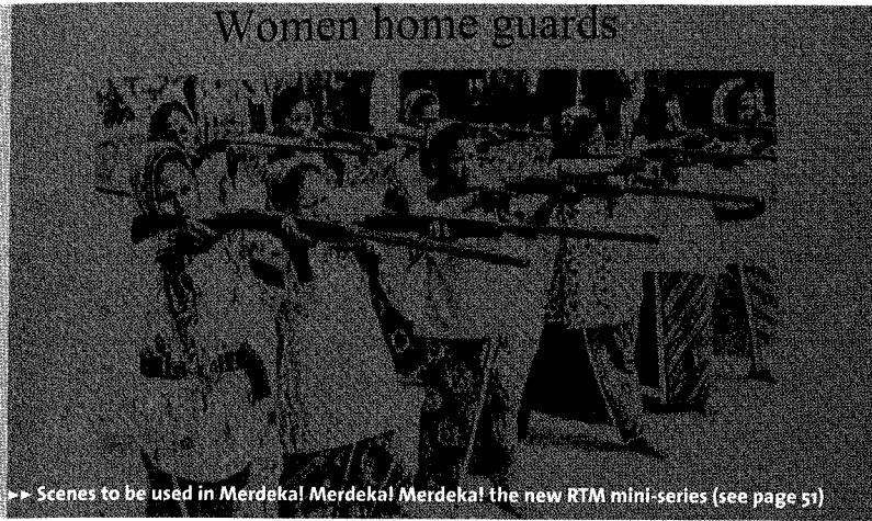
→ Scenes to be used in Merdeka! Merdeka! Merdeka! the new RTM mini-series (see page 51)