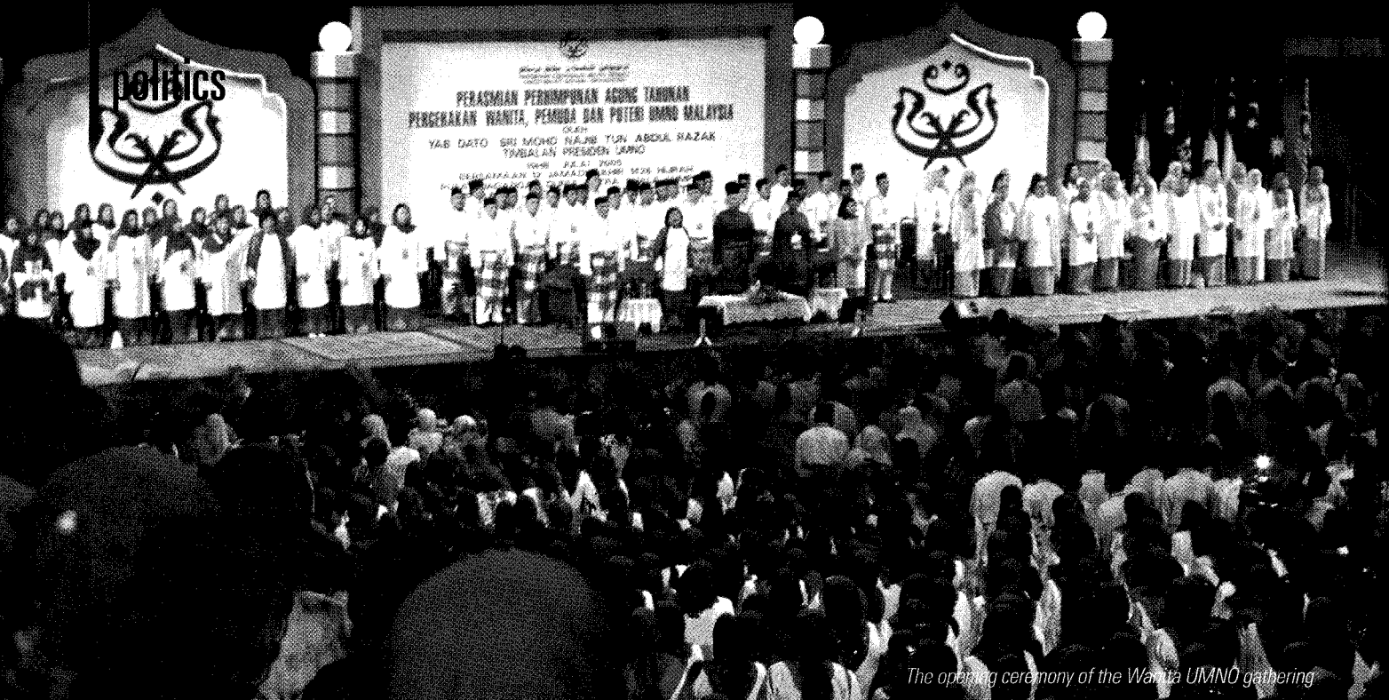
The opening ceremony of the Wanita UMNO gathering