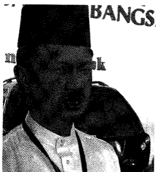
Norza: Pemuda is now at its peak