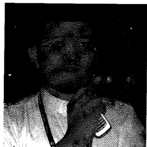
Pirdaus: The confusion of the past is no longer there

aided by the healing power of time. The Pemuda Masuk Kampung (Youth Visiting Villages) campaign has begun to bear fruit.