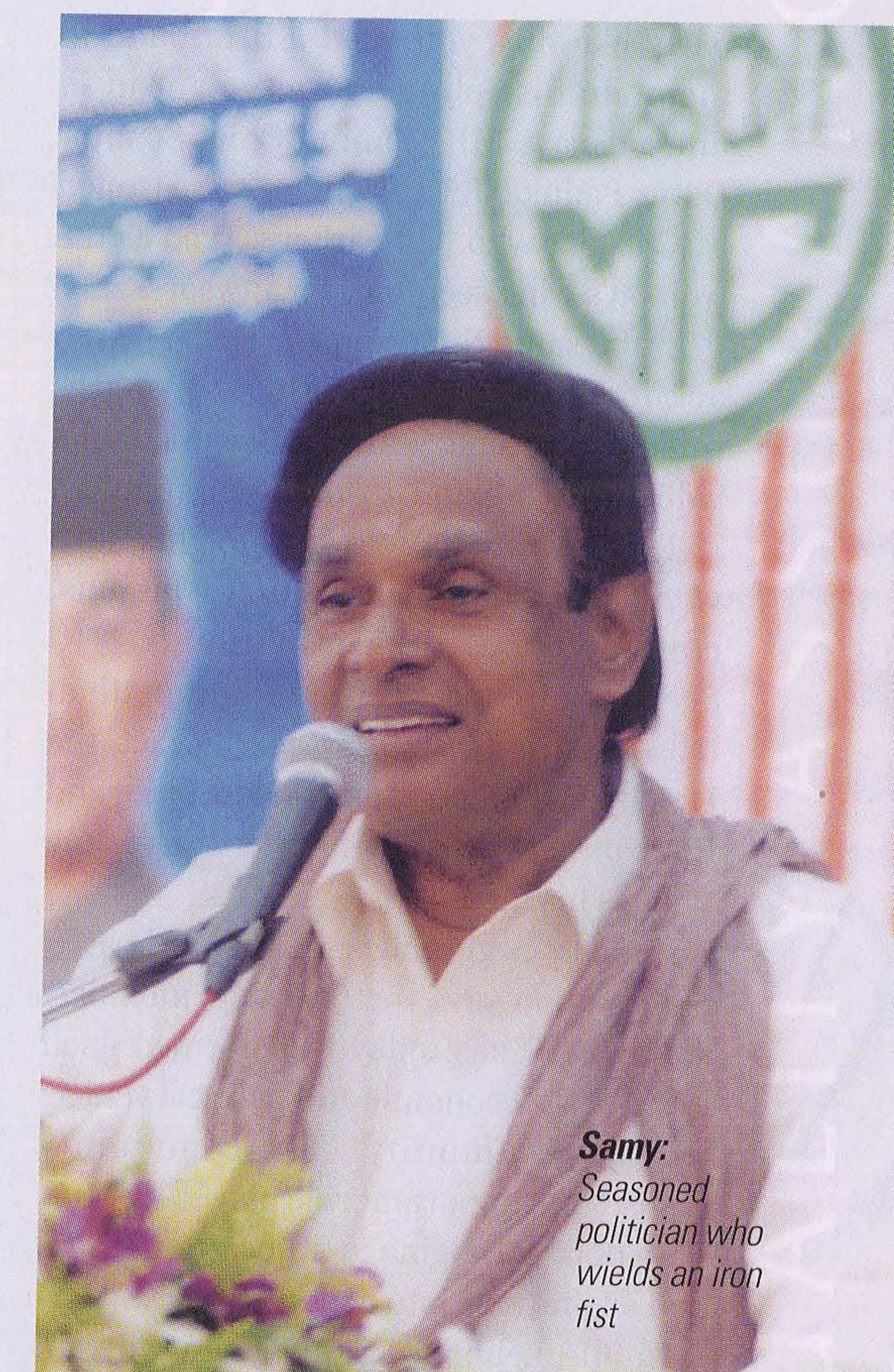
Samy: Seasoned politician who wields an iron fist

Some see no problems with it in the name of keeping the party united. 'For a