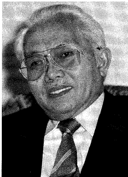
Taib: Strong indications that the grand old man of Sarawak politics is on the verge of retiring

Up to this day, Sarawakians are still wondering why Abdullah was not present during the election campaign. The Federal