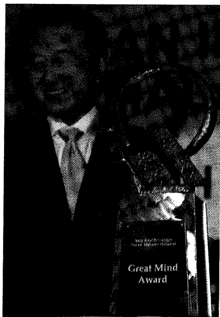
Dr Mahathir receiving the Great Mind Awards in conjunction with MINDS 20th Anniversary in 2006 banquet for his role in 'inventing' Malaysia

The exhibition included inventors from other countries like South Korea, Taiwan, Sri Lanka and Iran. Inventors showcased over 400 inventions from local universities, research institutes, individual inventors as well as corporate entities. The ITEX 06 awards covers 24 industrial categories that included Environmental (Renewable Energy), Biotechnology, Information Communication Technology, Agriculture, Engineering, Education, Health Science and International Awards. mb-e