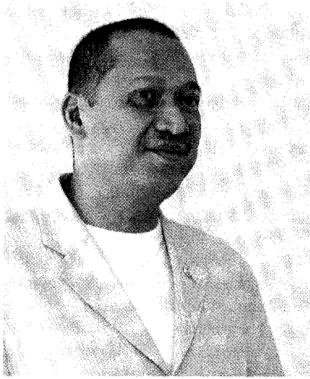
Nazri: The Whip is to ensure that MPs belonging to Government parties toe the line

Minister in the Prime Minister's Department Datuk Seri Nazri Abdul Aziz.