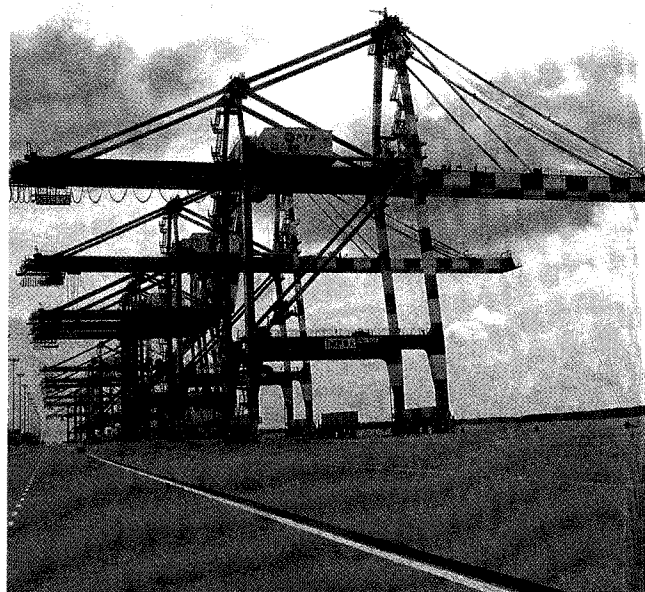
Having the bunkering service would be a major boost for PTP's customers