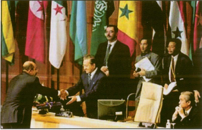
■ DECLARATION... Prime Minister Datuk Seri Dr Mahathir Mohamad as the Chairman of the 10th OIC Summit accepting the First Ladies OIC Dialogue Resolution and the Peace Memorandum from People's Alliance for Peace Malaysia from Foreign Minister Datuk Seri Syed Hamid Albar at the summit's closing ceremony in Putrajaya Convention Centre. Looking on is Deputy Prime Minister Datuk Seri Abdullah Ahmad Badawi (seating, right).

our human capital. They should be made to pay for the training of any nationality even Malaysians, then employ them after the training not just grabbing people who are already professionals. Malaysia can be the ideal training ground.