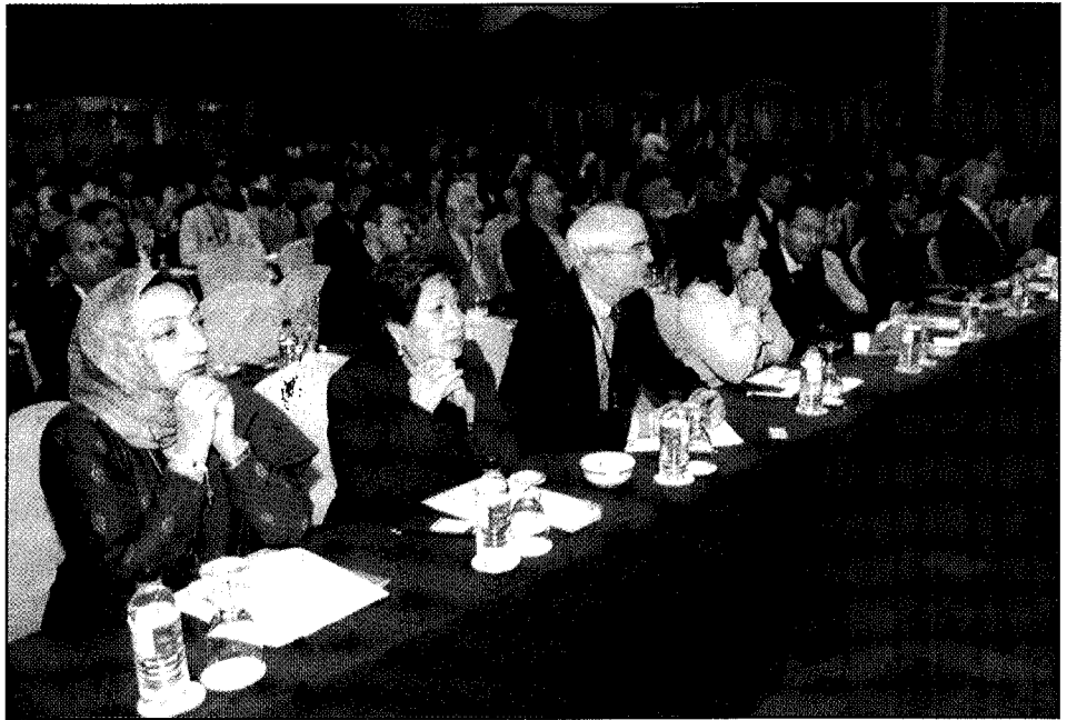
■ We should move forward in a unified manner.

1. The Muslim world needs the availability of an enabling physical infrastructure that provides the right environment for economic activities to take place. Public utilities and telecommunication facilities constitute the backbone of development and this