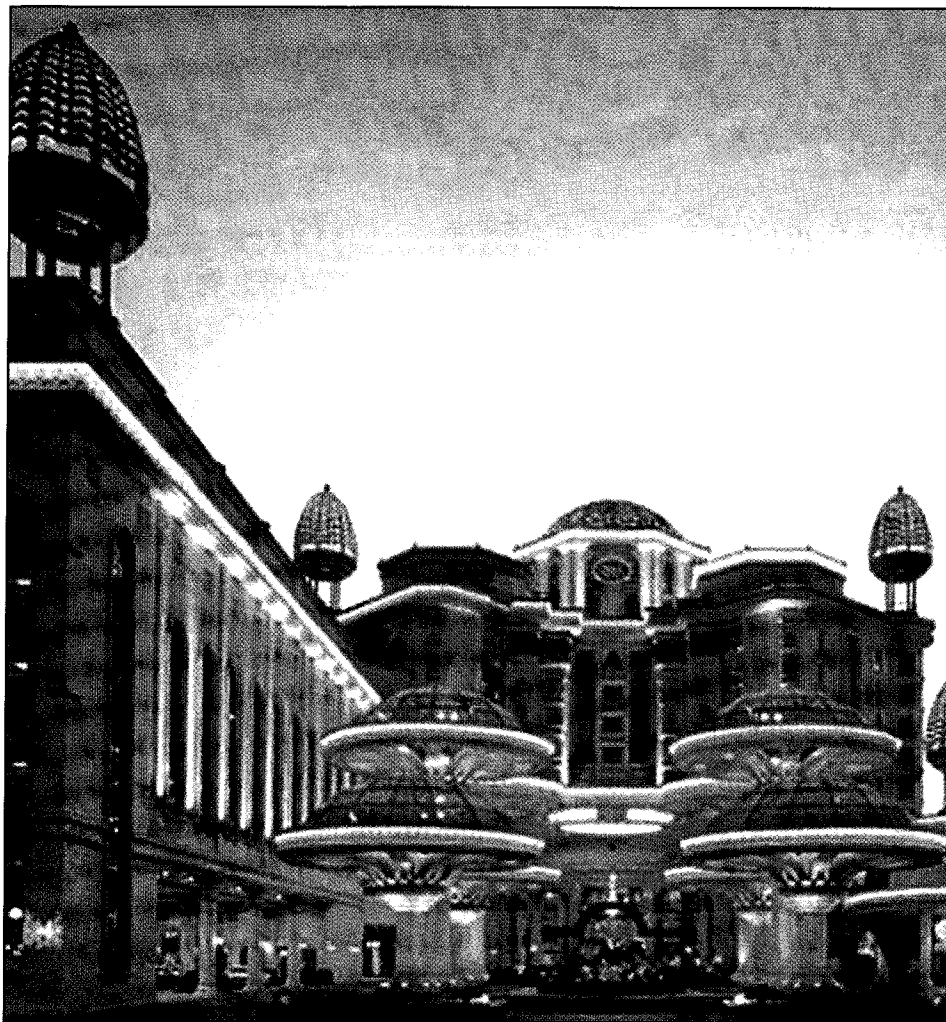
■ Sunway Convention Centre, Malaysia - venue for World Islamic Economic Forum.

Whether the summit was a success or not will be known in the near future. However, it remains an important event that took place in Malaysia, with the hope that it will be repeated in other countries in the years to come.